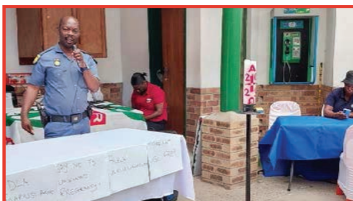
Officials from the Department of Health and SAPS sharing a message of support during the event.