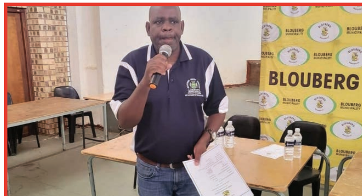
Presentation by the Department of Employment and Labour.