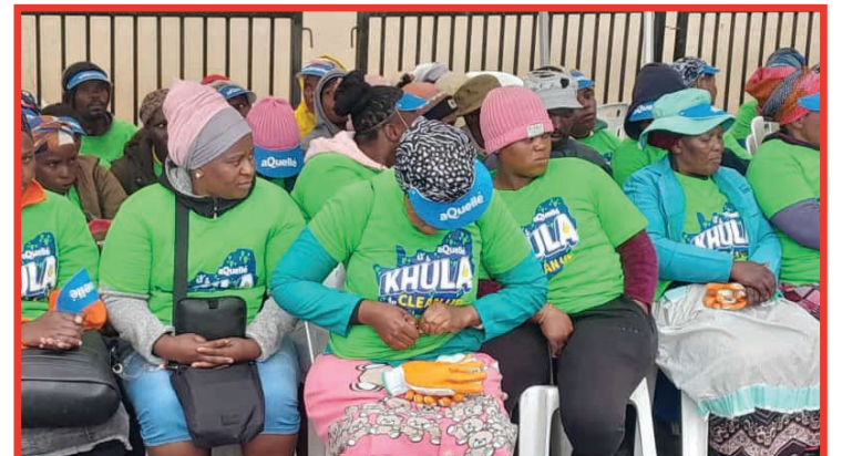
Thusong Service Centre stakeholders and Community Work Programme during the clean-up campaign and the information session led by Aqueel company.