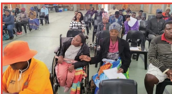
Organisations from disability organisations were in attendance.