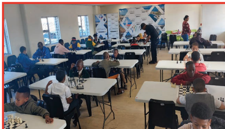
Various learners during the chess tournament at Mossel Bay Thusong Service Centre.