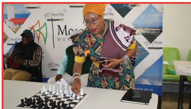
The Thusong Centre manager during the tournament.