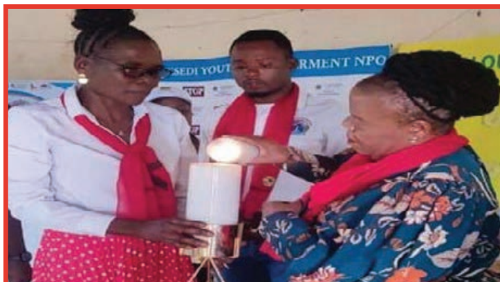
Youth empowerment officials together with other organisations during the lighting of a candle in commemoration of the fallen victims.