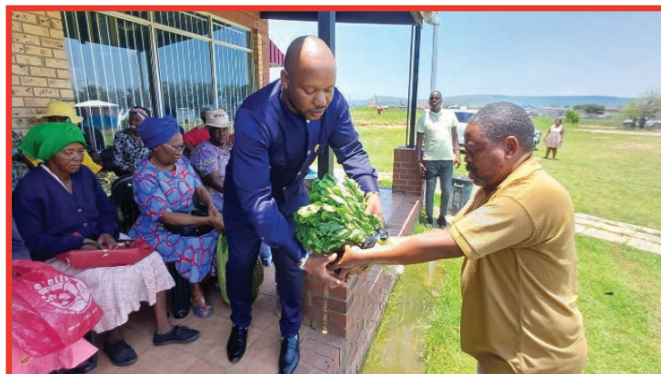
The Deputy Mayor donating vegetables. The harvest at the Kwa-Mdakane Thusong Service Centre.