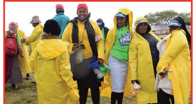
Community Work Programme members and Thusong Service Centre stakeholders displayed the raincoats donated by Aqueel company during the cleaning campaign.