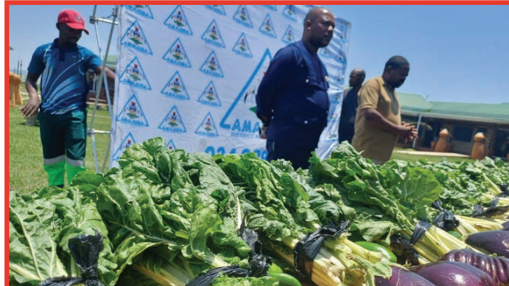
The Deputy Mayor donating vegetables from the Thusong Service Centre garden to community members at the centre.

the less fortunate community members by constantly planting a variety of vegetables, which in turn can be given to the families in the community. The Office of the Executive Mayor, led by the Deputy Mayor and other officials, handed over packs of vegetables and other goodies to community members.