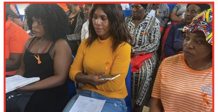
Community members who were in attendance.