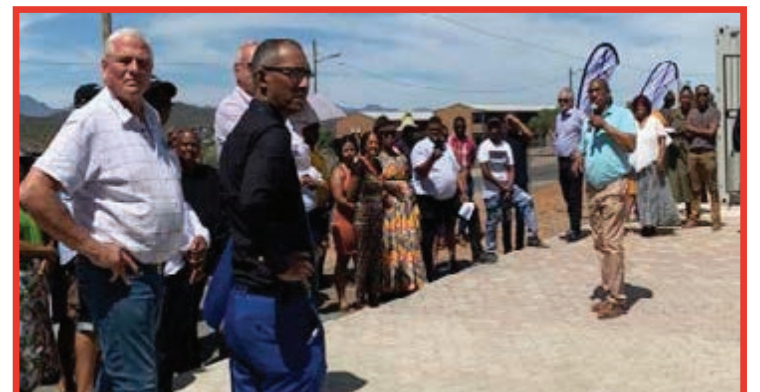
Executive Council of Oudtshoorn Municipality and key stakeholders.

“Thusong Service Centres, taking services and information closer to the people”