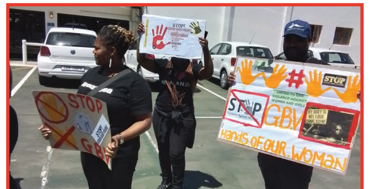
Gender-based violence and femicide march.