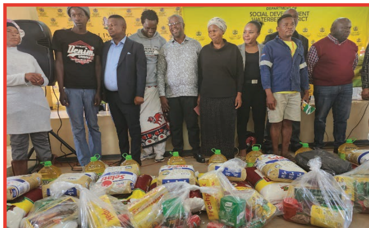
Beneficiaries receiving food parcels.

of South Africa, Government Communication and Information System, Department of Home Affairs, Department of Roads and Transport, Department of Correctional Services and the South African Police Service and Emergency Medical Services. Around 450 members of the community attended the event.