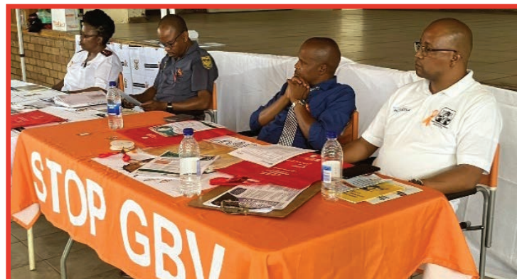
Representatives from various departments and organisations shared information regarding issues of GBVF.

organisations, including the South African Police Service and the Department of Health. Community members were encouraged to report any GBVF red flags to local authorities and church leaders. #16DaysOfActivism.