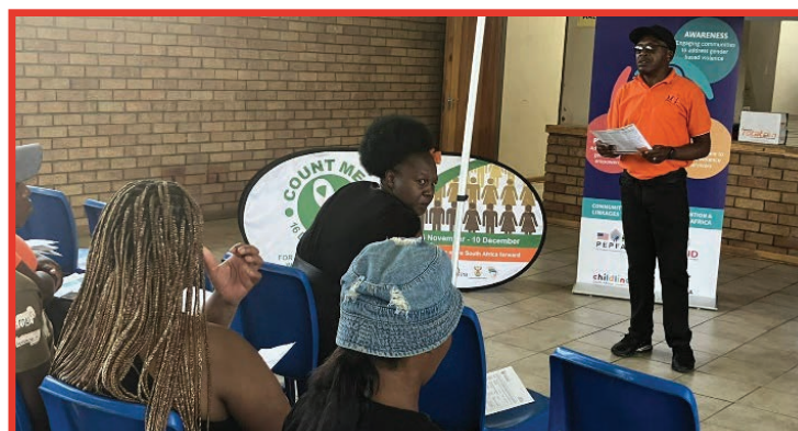
A presentation by the Department of Social Development official.