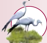
National bird: blue crane