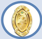
The Order of Mendi for Bravery