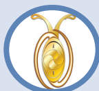
The Order of the Companions of OR Tambo