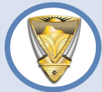
The Order of Luthuli