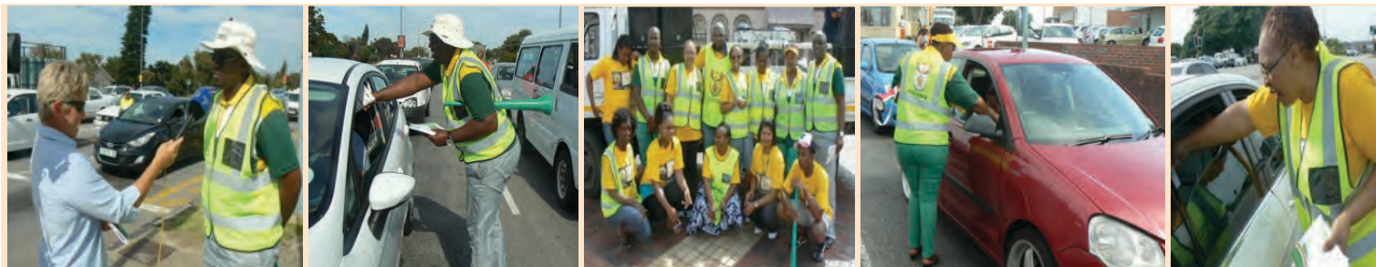
The awareness campaign received primetime media coverage on national and international platforms. The blitz campaign to inform the public on the event was innovative and effective, taking government’s message straight to the people.

Needless to say, this was a concerted team effort involving various workstreams that included media mobilisation, photography, branding, logistics and report-writing. It is all systems go for the Eastern Cape