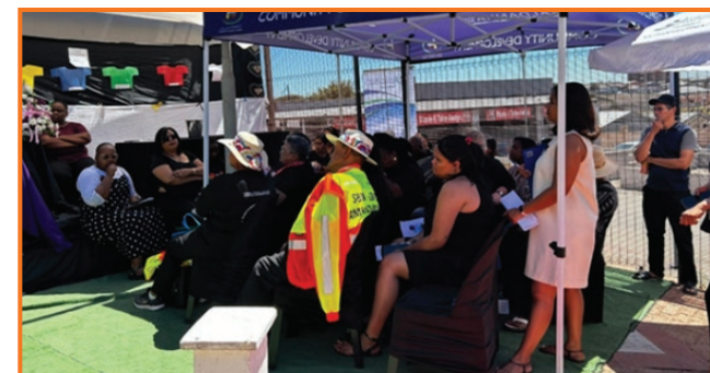
Community members at the launch.