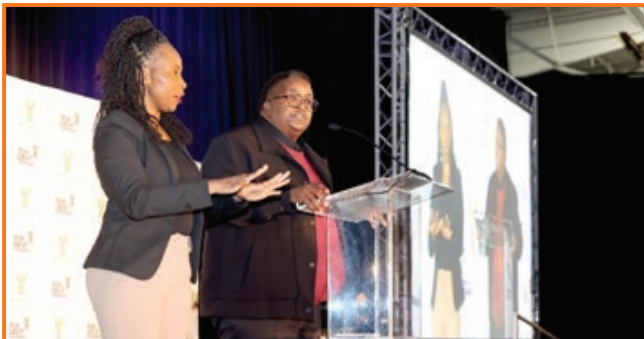
Deputy Minister Letsike delivers the opening remarks at the launch of the 16 Days of Activism of No Violence Against Women and Children.

The 2025 campaign is observed under the theme: “Letsema: Men, Women, Boys and Girls Working Together to End GBVF”.