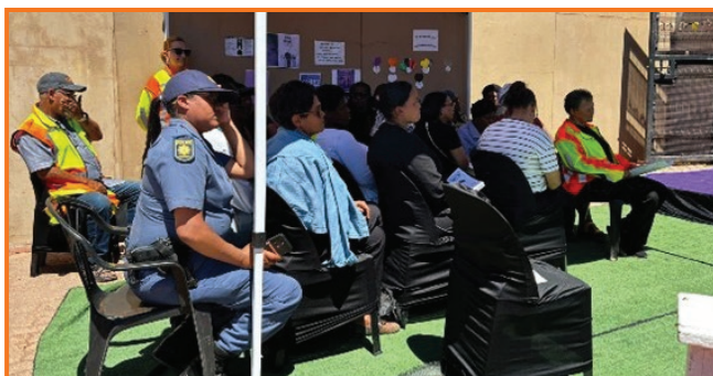
Community members, SAPS members and different community leaders attended the launch.

The opening of the Louwville GBVF Office represents hope and progress, ensuring that survivors have access to justice and support while reinforcing the national call to end violence in all its forms.