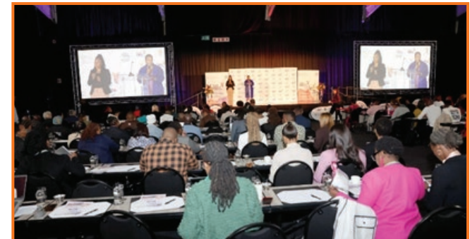
The launch of the 16 Days Of No Violence Against Women and Children campaign held at the Gallagher Convention Centre in Gauteng.