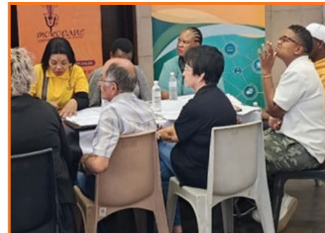
Representatives from media houses discuss issues of compliance during the roundtable session.