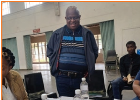
Mr Lebotse shares best practices with the media from the Waterberg District.

Moutse FM owns the building from where it broadcasts, which comprises of four studios and generates funds through advertising.