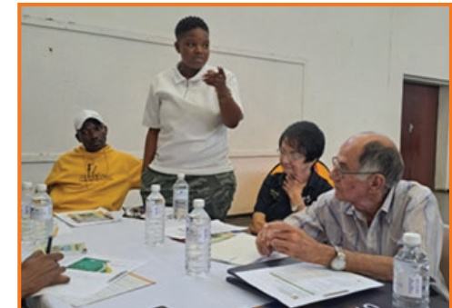
Discussions around issues of compliance taking place during the session.