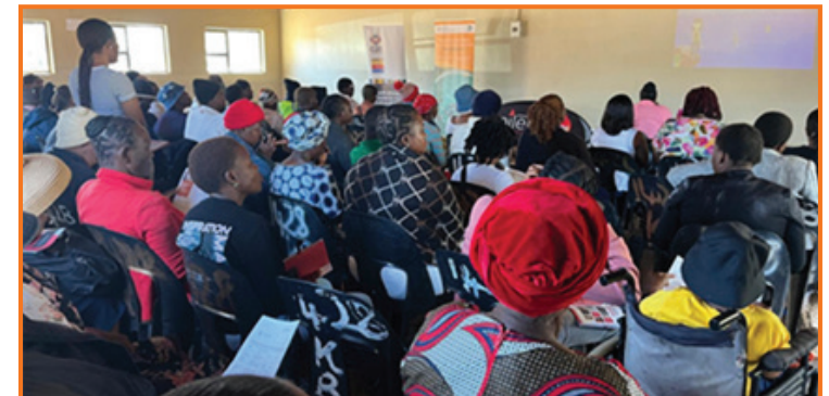
Attendees of the women's GBVF Dialogue held at Siyabuswa in the Dr JS Moroka Local Municipality.