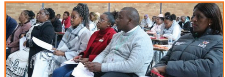
Some of the stakeholders who took part in the programme.