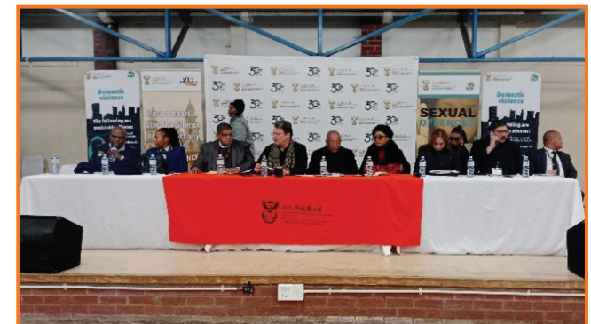
The participating panel at the GBVF Imbizo comprising the DoJ DM, the South African Police Service Cluster Commander and the departments of Health and Social Development.