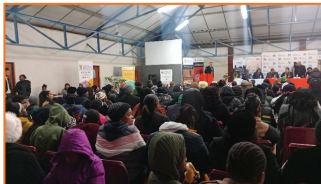
A fully packed school hall at the St Mark's Primary School awaits presentations from various agencies and government departments.