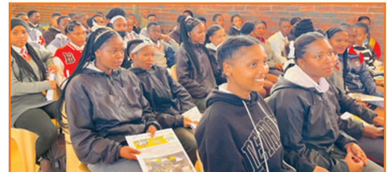
Female learners from Patensie Agricultural School during the women's dialogue.