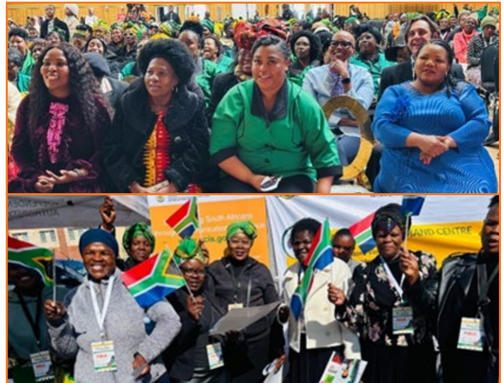
Women's Day celebration at Sydney Choma Banquet Hall in the Steve Tshwete Local Municipality.