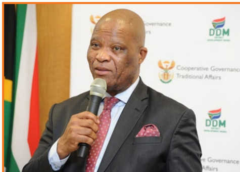
Deputy Minister of CoGTA, Dr Masemola, leads the oversight visit in the EC.

The session was attended by key stakeholders, including officials from National Treasury, councillors from the municipality and other government representatives.