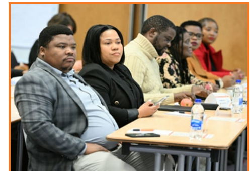
Key stakeholders that attended the session.