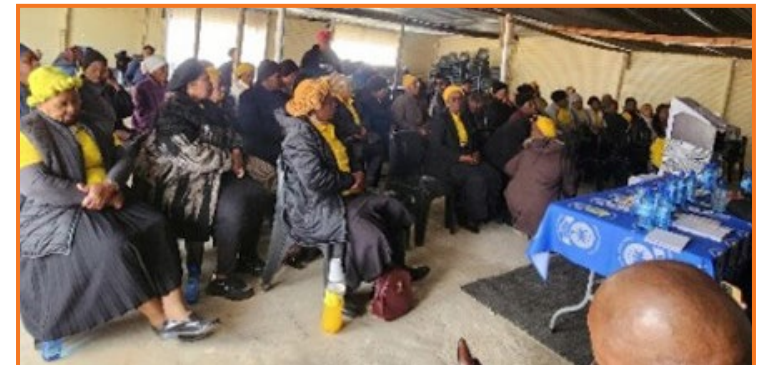
Community members attending the Women's Month session.