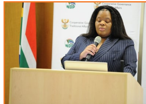
Cllr Faku delivered a presentation on challenges facing the municipality.