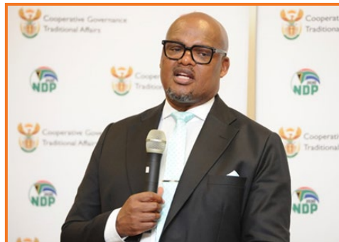
MEC Williams accompanied the Deputy Minister during oversight visit.