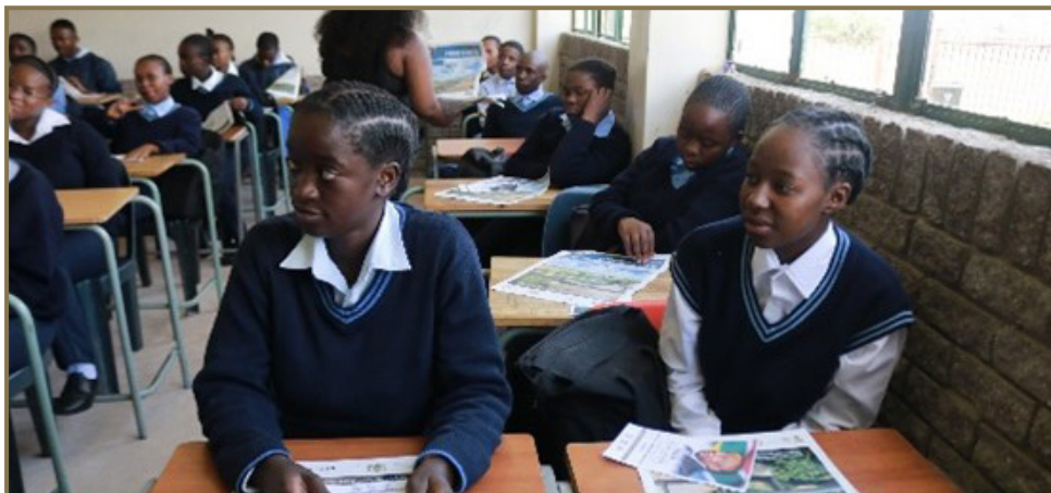
Learners of Iphondle Secondary School in Warden, listening attentively to the SoNA message.