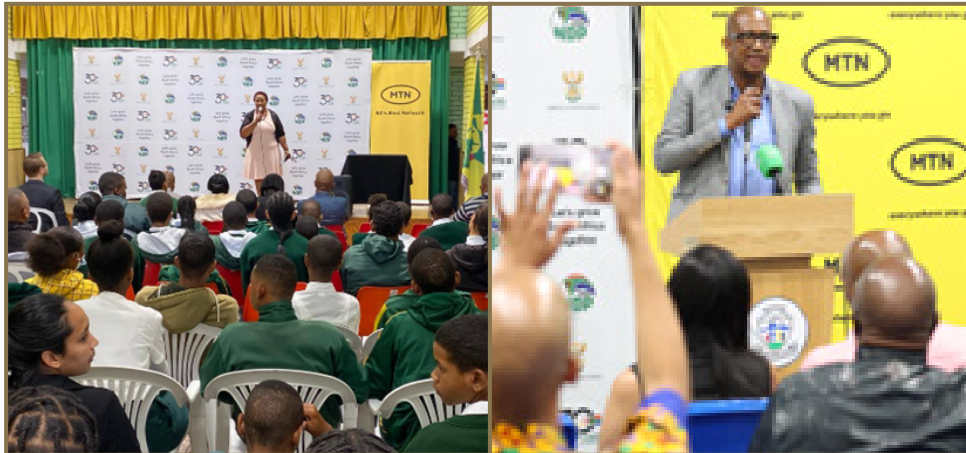
Deputy Minister Morolong joined by senior officials from MTN South Africa and Capital Centric, officiating the Schools Connectivity Programme at Rusthof LSEN Primary School.