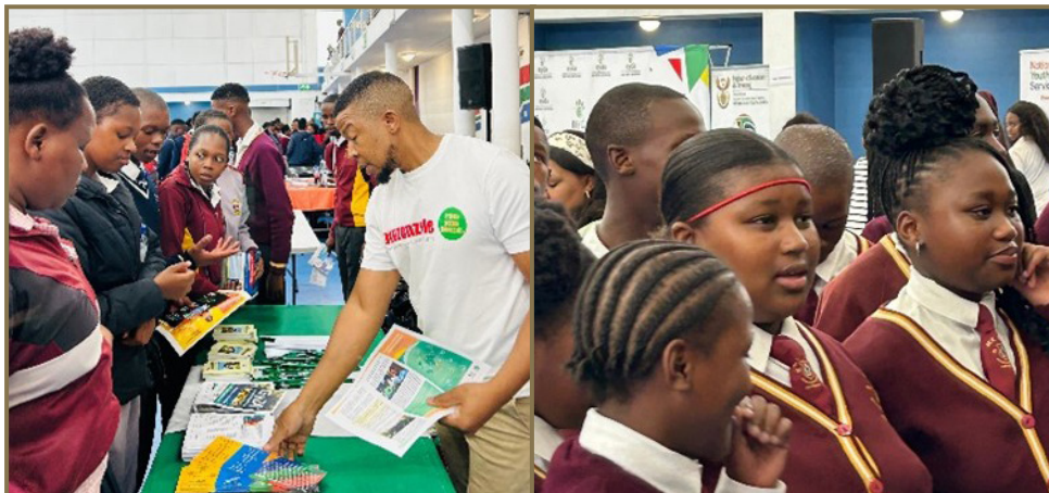
The GCIS exhibited and supported the National Youth Development Agency and the DHET at a career guidance and opportunities expo in Khayelitsha.