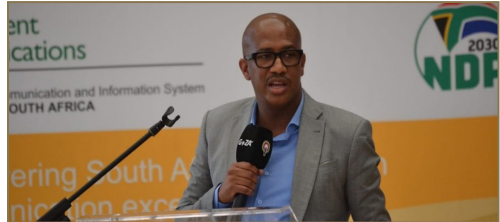
Deputy Minister Morolong highlighting the need for financial sustainability and digitalisation of community media during the MDDA's Community Media Consultative Forum at the Khayelitsha Thusong Centre.