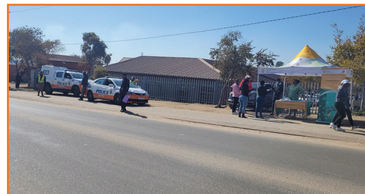
One of the stalls used to provide information on the Presidential Inauguration to the community of Cosmo City.