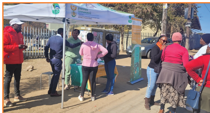
Government communicators engaging with the public ahead of the Presidential Inauguration.

In his inaugural speech, President Ramaphosa outlined his vision and plans for his five-year term of office.