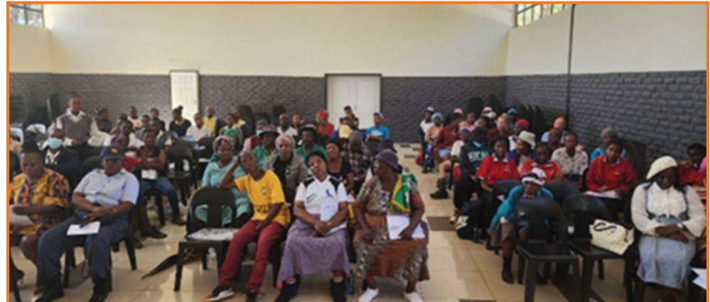
Attendees listen to reflections of how life was before and after democracy.