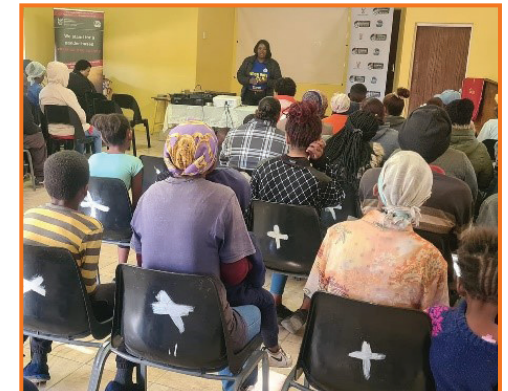
A SAPS officer encouraging the residents to report crime and protect children.