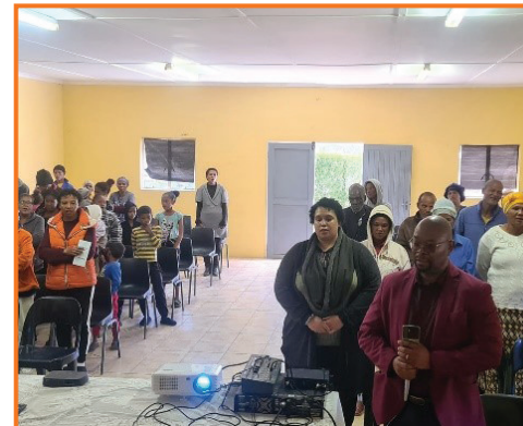
Residents observing the National Anthem ahead of the live viewing of the Presidential Inauguration.