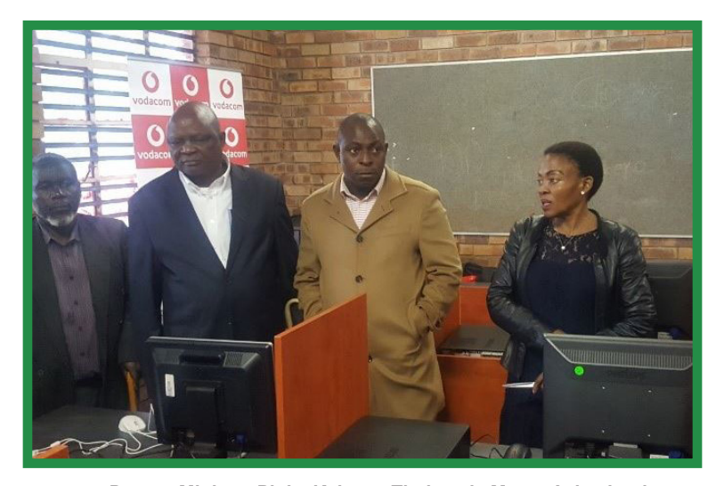
Deputy Minister Pinky Kekana, Thulamela Mayor Avhashoni Tshifhango and Chief Zwithuzwavhudi at the ICT centre.