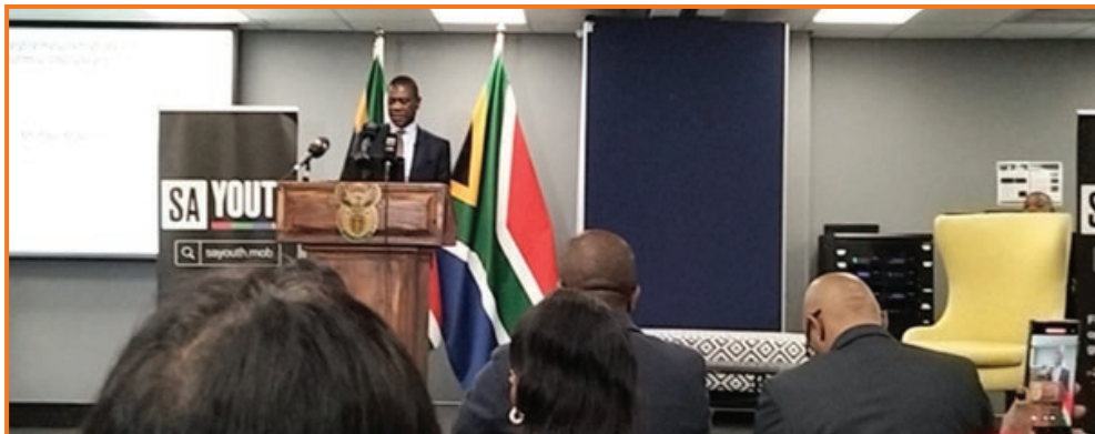
Deputy President delivering a keynote address at the Harambee Youth Employment Accelerator offices in Braamfontein, Johannesburg.

The discussions were followed by mock interviews designed to offer young work seekers a unique opportunity to prepare for interviews guided by industry leaders. Harambee aims to address the high rate of youth unemployment in South Africa by connecting young people to work opportunities and providing support services like work readiness training and access to resources.