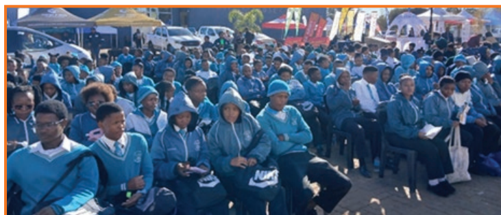
Learners attending the Phunya Tsela Career Expo.