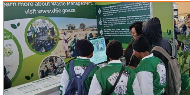
Learners engaging with exhibitors.

Geraldine Thoppes 021 418 0533/2307 or 081 281 2200 Geraldine@gcis.gov.za