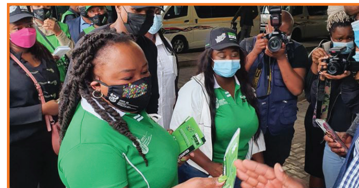
Deputy Minister Thembu Siweya engaging with taxi drivers in Diepsloot.