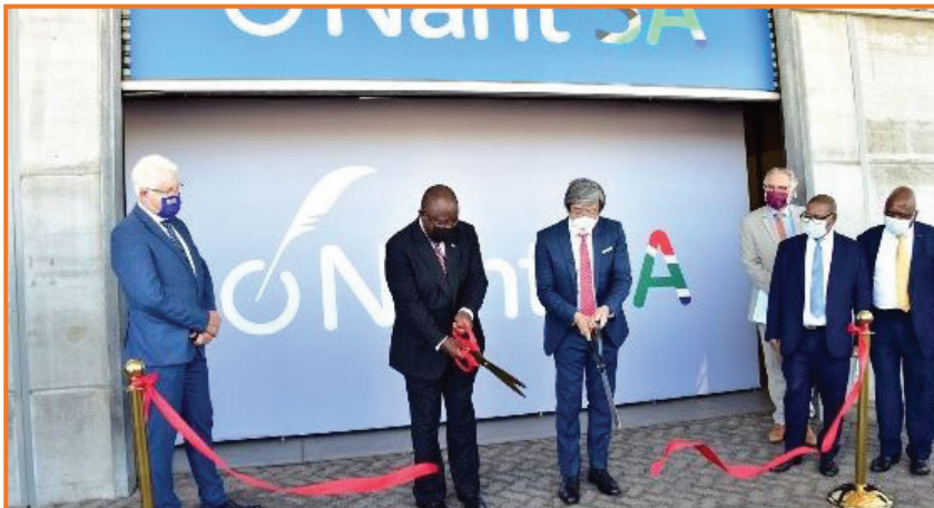
President Cyril Ramaphosa and Dr Patrick Soon-Shiong officially opening the Vaccine Manufacturing Campus in Brackengate, Cape Town

Many young Africans will benefit from the R100 million endowment that the Chan Soon-Shiong Family foundation has established to support the education and training in a skilled workforce in the biotechnology and life science industry.