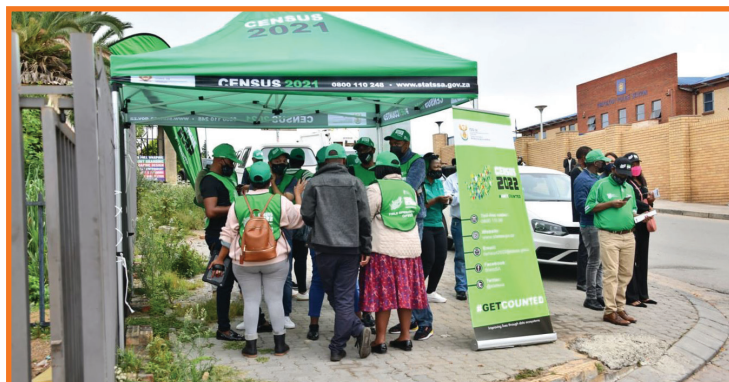
Census exhibition at a taxi rank in Diepsloot.

The counting will include everybody within the borders of South Africa.