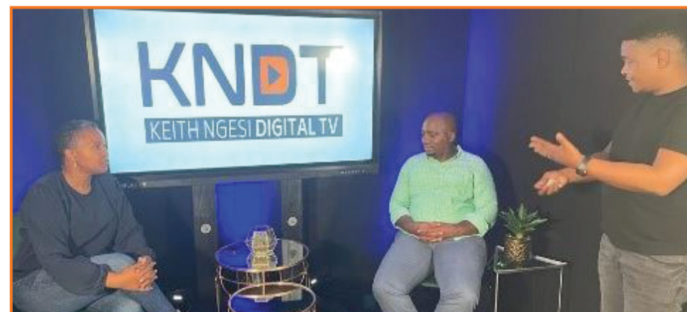
KNM CEO taking GCIS through the operations of Keith Ngesi Digital TV.