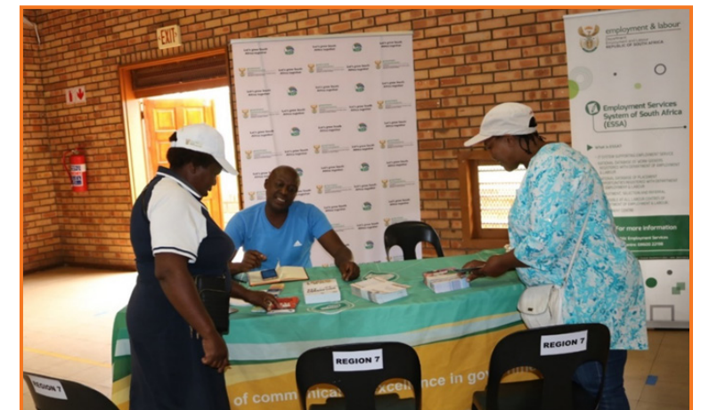
Community members accessing government information products.