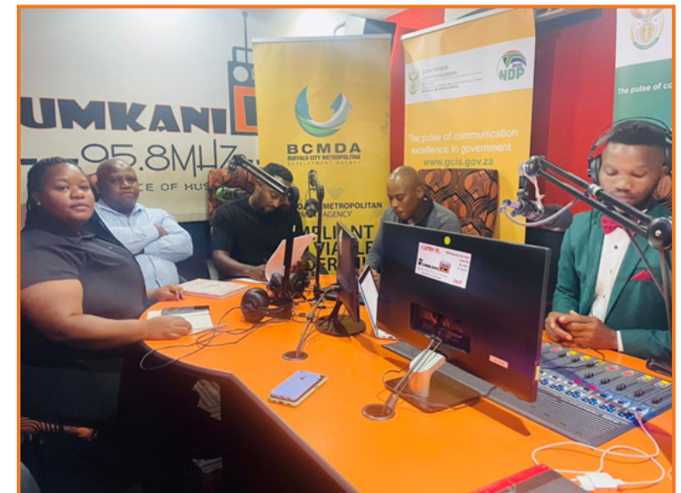
Panel discussion at Kumkani FM with stakeholders.

During the discussions, stakeholders shared their programmes with the communities, which was welcomed with enthusiasm by the communities as this, is the information that would contribute in transforming their lives.