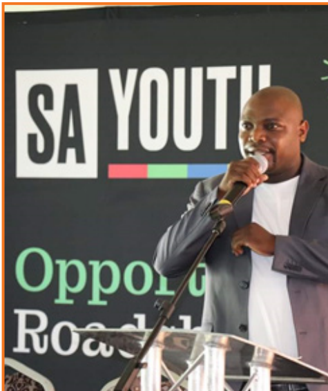
An official from the City of Mbombela Local Municipality welcoming all young people.

The GCIS requested all youth development offices to assist with the list of beneficiaries, so that they can be profiled in community radio stations to motivate others about the benefits of attending youth seminars and dialogues on job creation.