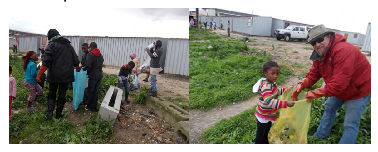
Adults together with kids cleaning Wetland and open field in Ward 91, contributing their 67 minutes of the Nelson Mandela Day in Site B, Khayelitsha