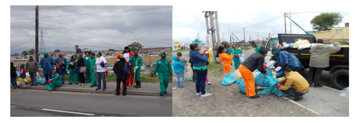
EPWP and Community Works Programme volunteers in a massive drive cleaning campaign and with some sorting for Waste Management and Recycling.