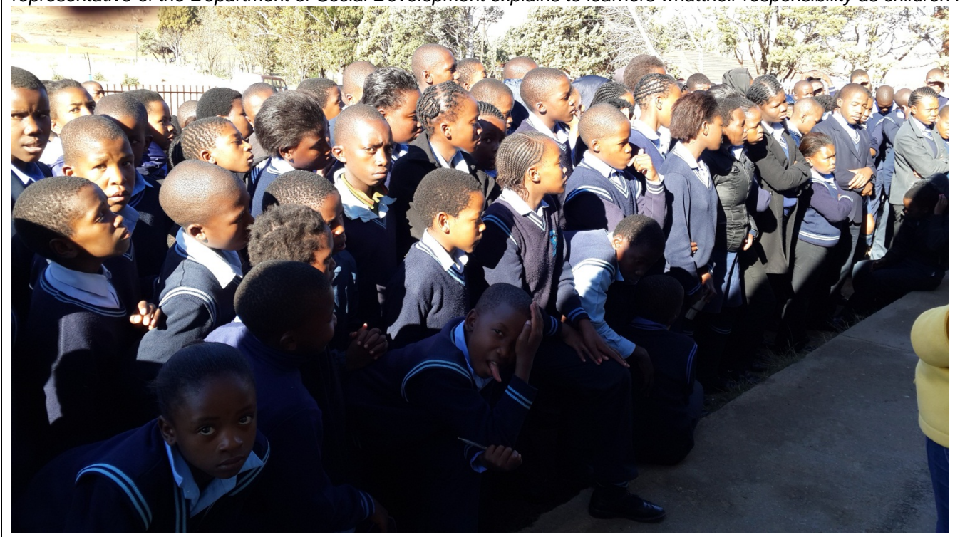
Learners from Breda Farm School listen to presentations on child trafficking and their responsibilites as children.