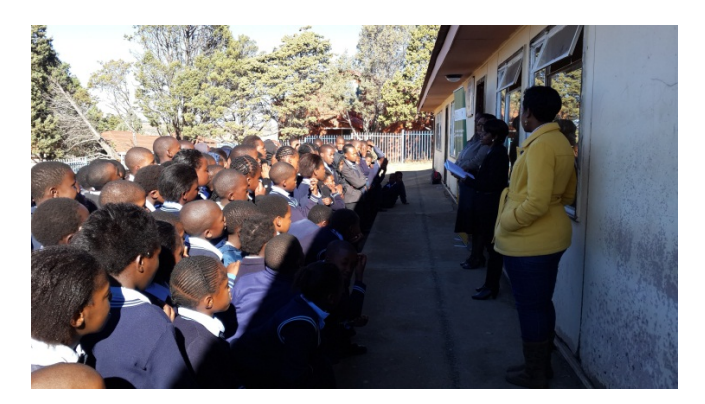
(Left): A representative of the Department of Health explains health issues relating to human trafficking. (Right): A representative of the Department of Social Development explains to learners whattheir responsibility as children is.