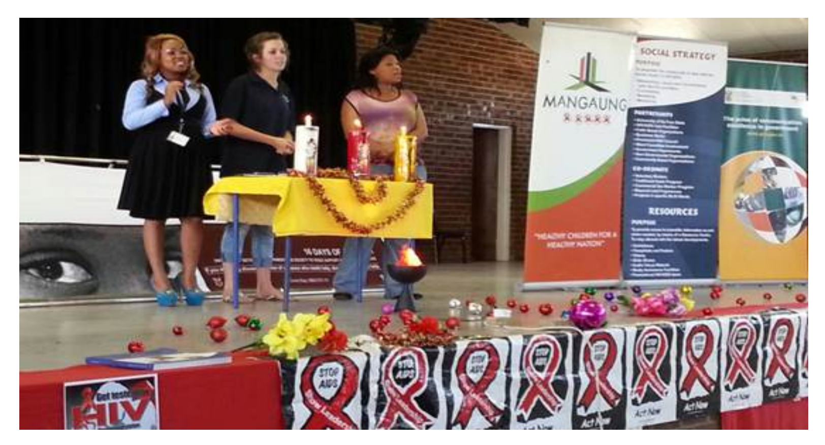
Stakeholders light candles during the 16 Days of Activism Dialogue in Mangaung.