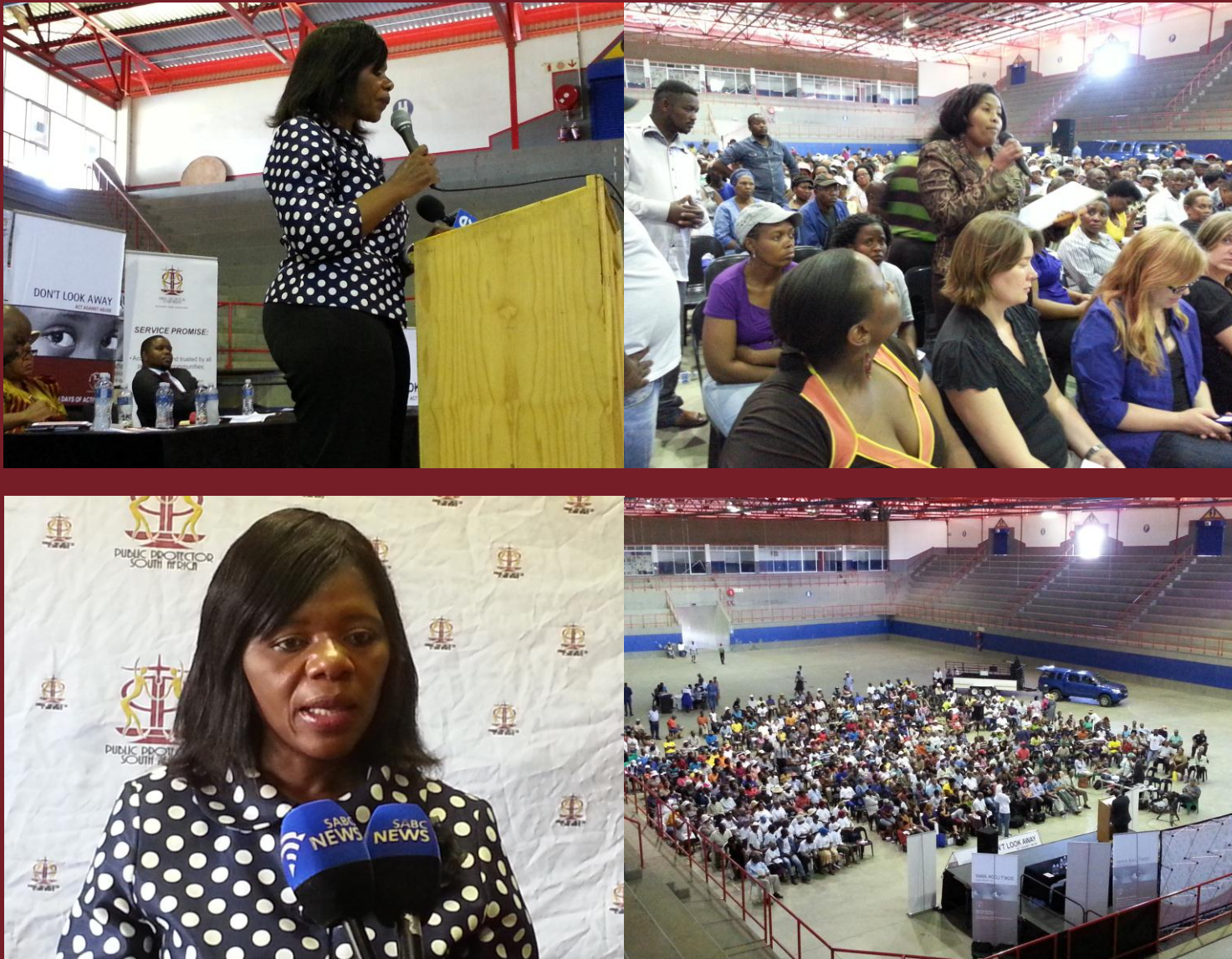
CAPTION: Public Protector Adv. Thuli Madonsela spoke against abuse of women and children at Kaiser Sebothelo Stadium in Botshabelo.