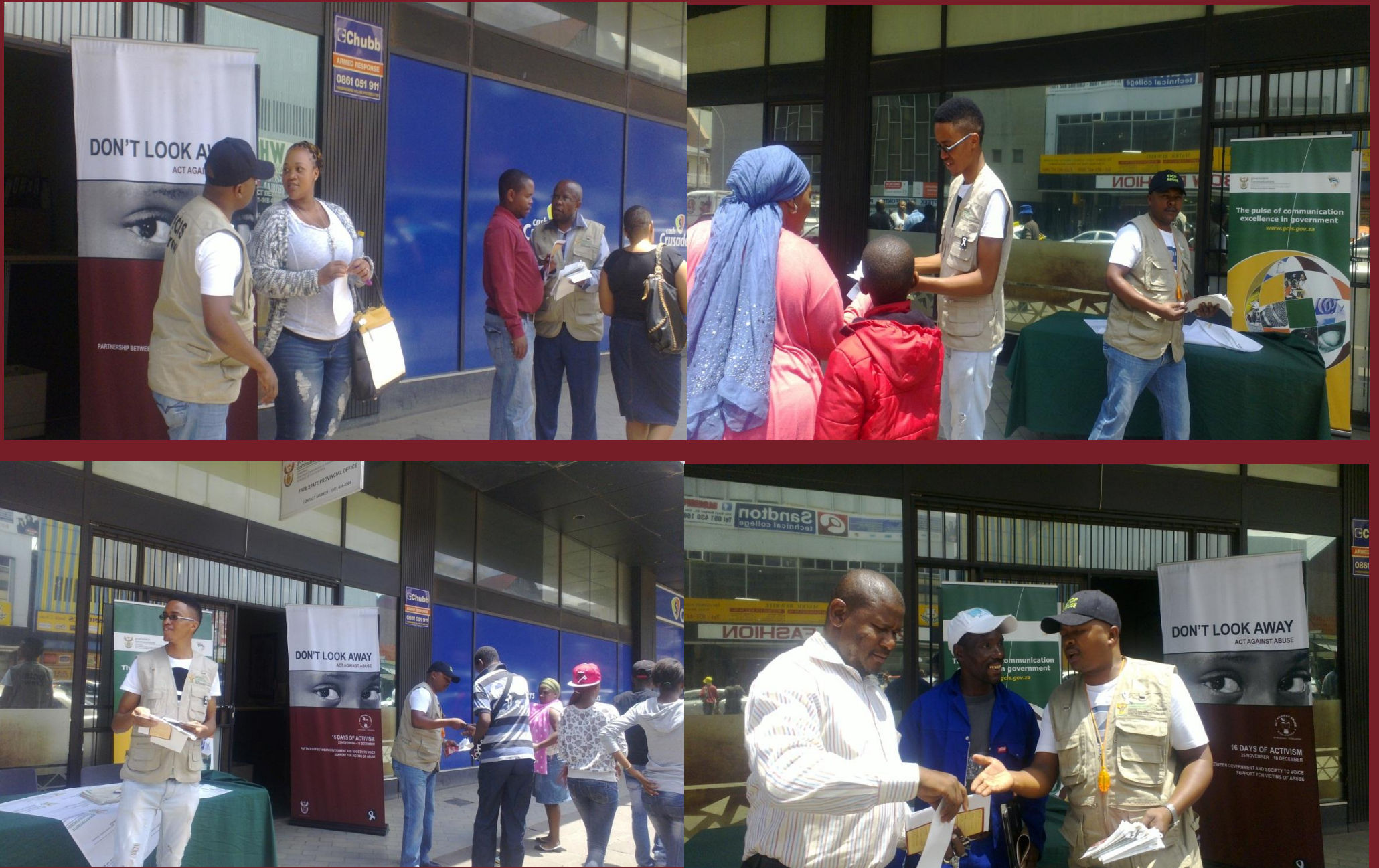
CAPTION: Government and Mangaung residents say no to abuse together.