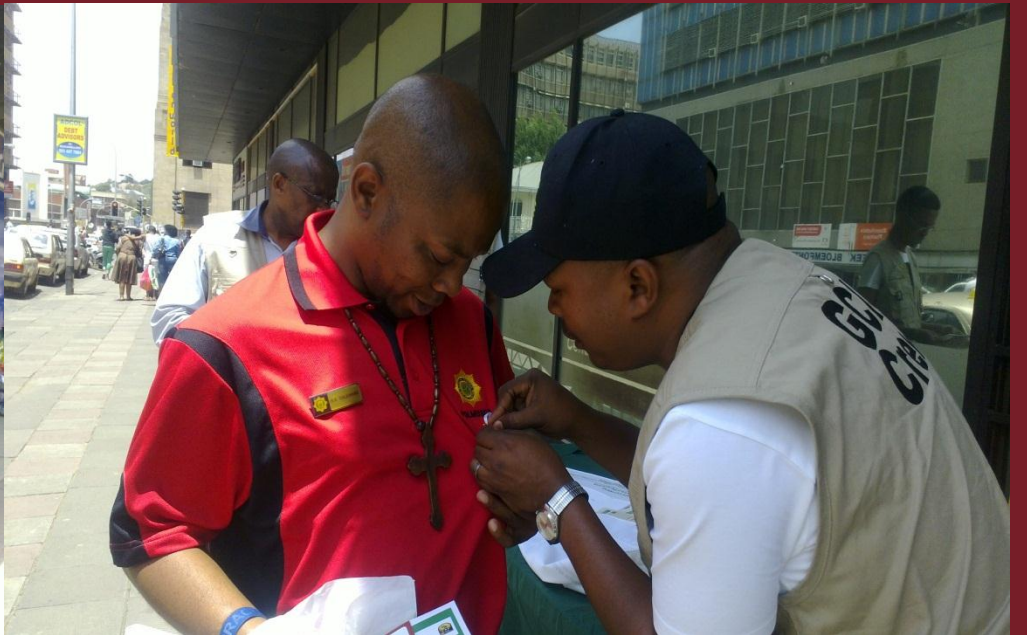
CAPTION: Men add their voices to saying No against abuse.