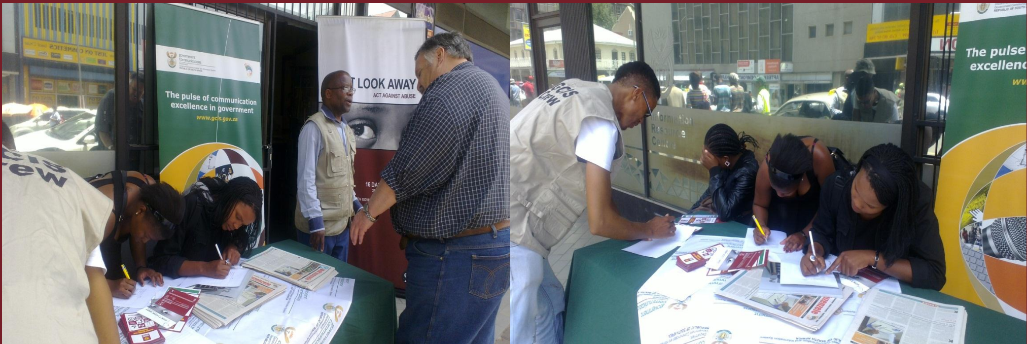
CAPTION: GCIS Free State Crew adding community voices to campaign against gender based violence and abuse of children.