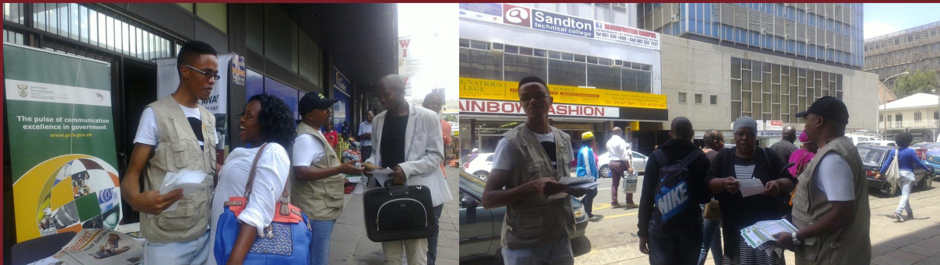
CAPTION: After all, it is our responsibility to create a safe environment for our children, women and men. Together we can!