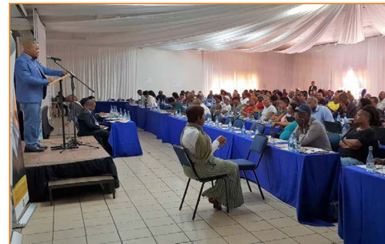
Acting Free State Premier Tate Makgoe addressing delegates.

A social sector dialogue was held in Bloemfontein on 14 to 15 February 2019, in preparation for a national summit with President Cyril Ramaphosa. The dialogue came as a result of the key matters raised by the President during the 2018 State of the Nation Address. The dialogue was split into four commissions, which deliberated on topics such as resource mobilisation, capacity building, regulatory framework and transformation of the sector.