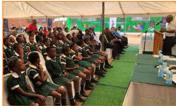
Besilindile Primary School learners during the handover of the library by the AVBOB Foundation.