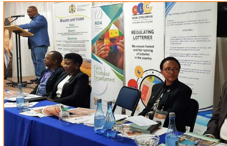
The panel members that participated at the dialogue.