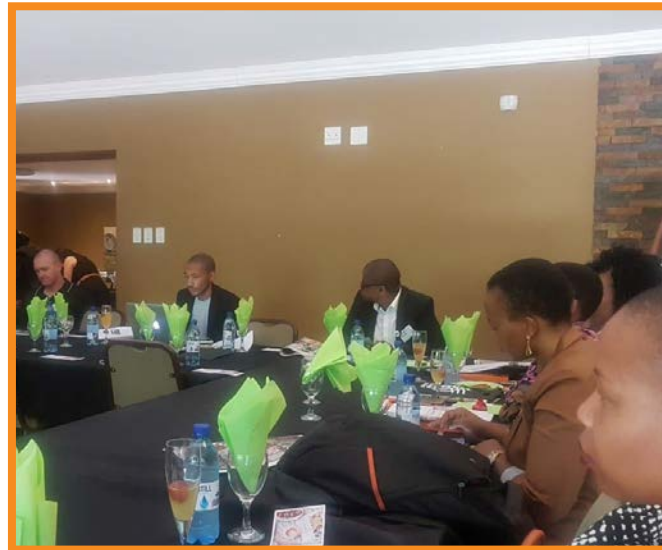
Attendees listening to presentations at the event.