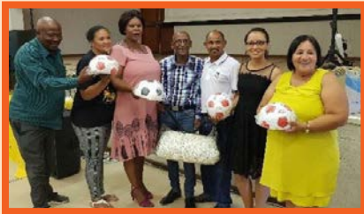
The local soccer team received donations from the district municipality.