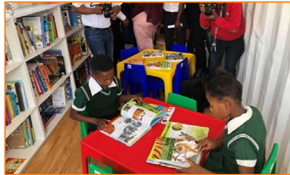
Besilindile Primary School learners inside the new library.