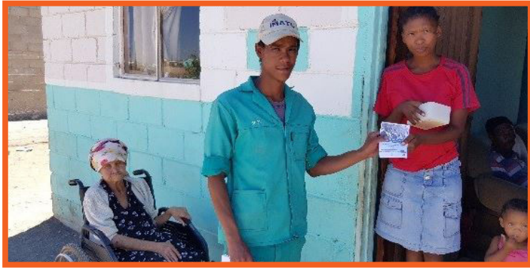
Door-to-door campaign to market the SoNA.

“It was very interesting to listen to the President speaking. I hope that government delivers on all the promises.”