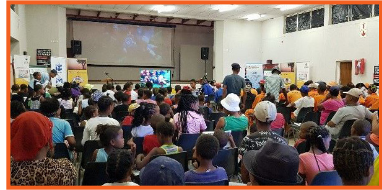
Community members watching the SoNA.

The Government Communication and Information System coordinated a service-delivery outreach and the live broadcast of the State of the Nation Address (SoNA) in partnership with the Namakwa District Municipality, Karoo Hoogland Local Municipality, the Department of Social Development, South Africa Social Security Agency, Independent Electoral Commission, the South African Police Service and the Department of Home Affairs at Fraserburg on 7 February 2019.