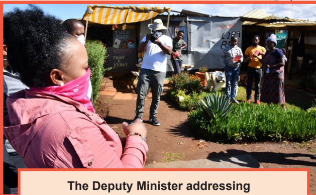
The Deputy Minister addressing residents in Mandela Informal Settlement.