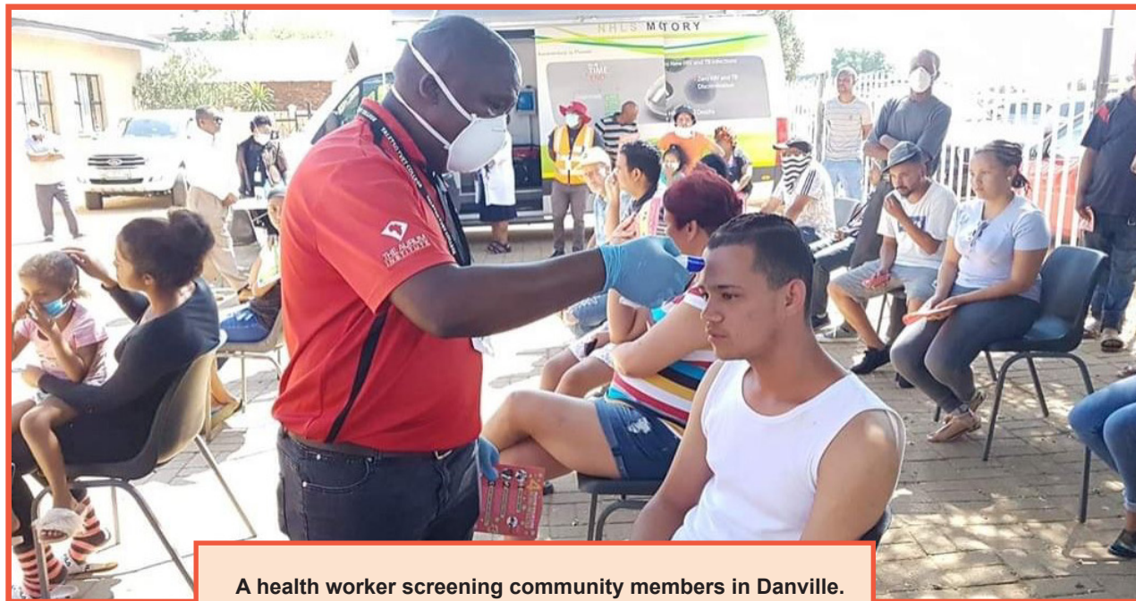
A health worker screening community members in Danville.