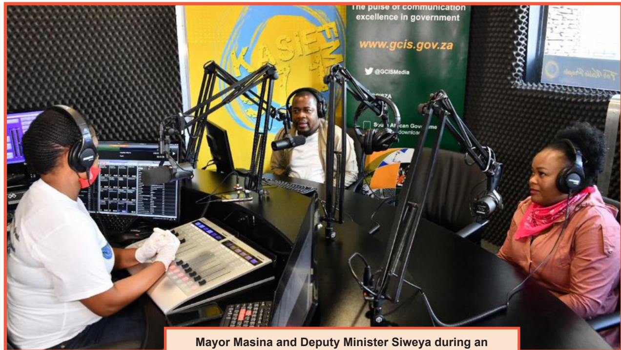
Mayor Masina and Deputy Minister Siweya during an interview at Kasi FM.

On 16 April 2020, Deputy Minister in the Presidency, Ms Thembi Siweya, accompanied by the City of Ekurhuleni Executive Mayor Mzwandile Masina, visited Tamau Clinic in Katlehong to monitor the implementation of disaster management rules during the lockdown period.