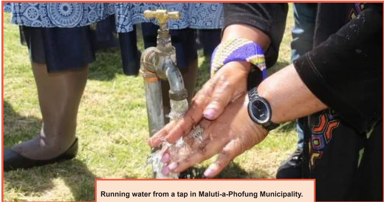
Running water from a tap in Maluti-a-Phofung Municipality.

On 7 April 2020, Free State Premier Sefora Ntombela and the province's Cooperative Governance MEC Thembeni Nxangisa officially opened water supply from the Fika-Patso Dam in Qwaqwa. The area has been battling with water shortages for years due to drought and had to access it through water tanks.