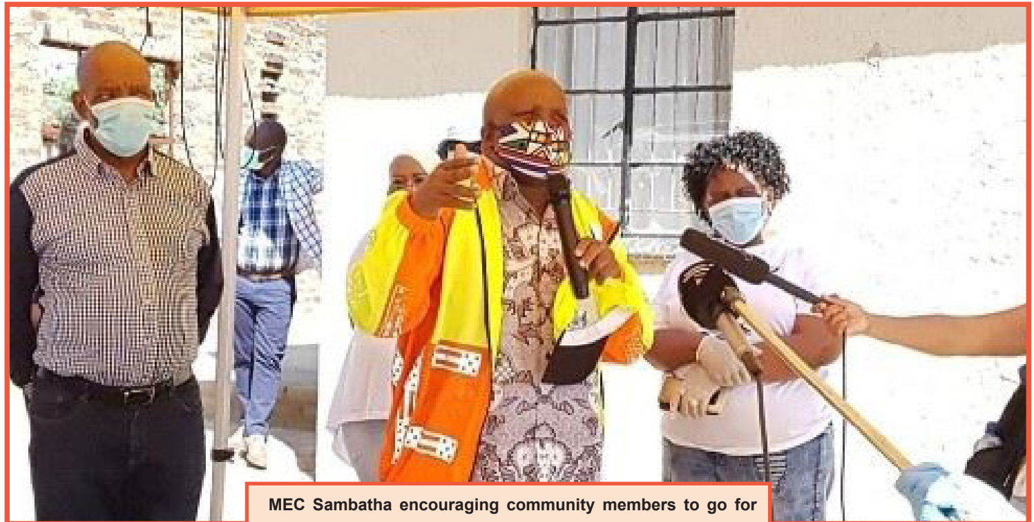
MEC Sambatha encouraging community members to go for voluntarily COVID-19 testing.

More information on COVID-19 can be accessed on: https://sacoronavirus.co.za/ , the toll free number: 0800 029 999 and the WhatsApp helpline for South Africans: 0600 123 456 . Type the word “Hi” on WhatsApp and send it to the helpline to get information on COVID-19.