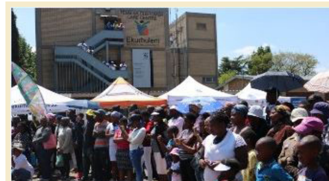
Community members listening to presentations during the event.

The City of Ekurhuleni has previously arranged extensive programmes to celebrate Transport Month, including free roadworthy tests for minibus taxis, buses and trucks in three of its testing stations in Brakpan, Boksburg and Kempton Park.