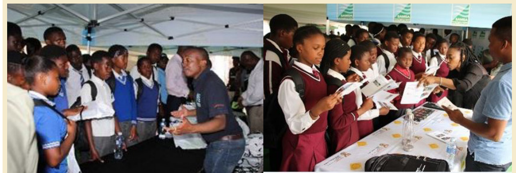
► Learners visiting exhibition stalls for information on the maritime industry.

by building their own ships, singing, dancing and poetry, and the winning schools were awarded trophies and certificates.