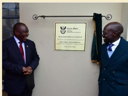
► President Cyril Ramaphosa and Home Affairs Minister Malusi Gigaba opening the Kokstad Home Affairs offices.