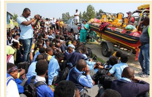
► Learners listening to presentations.