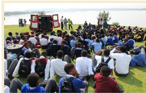
► Some of the learners who were in attendance.

Learners also participated in the maritime awareness school competition