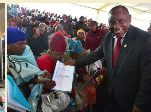
► President Cyril Ramaphosa handing over title deeds to Franklin citizens during his visit in Kokstad.

President Cyril Ramaphosa officially opened the new Home Affairs building located within the centre of Greater Kokstad on 3 October 2018.