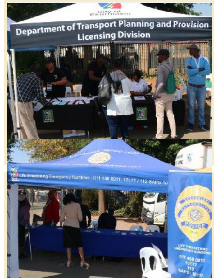
► Community members receiving information materials at the event.