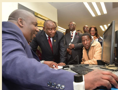
► President Cyril Ramaphosa engaging with Home Affairs officials.