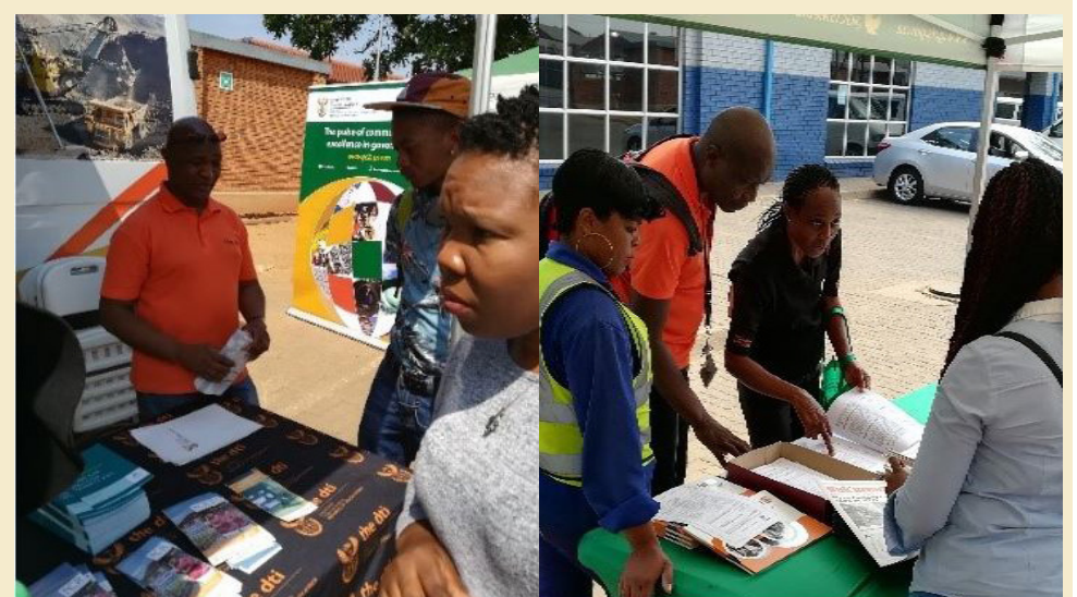
► Community members accessing information materials.

On 12 October 2018, Government Communication and Information System (GCIS) together with the Department of Trade and Industry (the dti) held an activation at the Silverton train station.