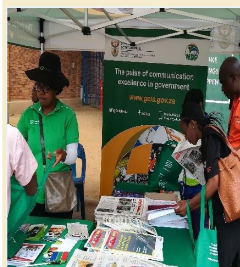
► GCIS officials engaging with the public.