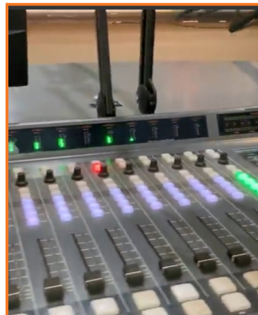
The new equipment and studio at Inanda FM.

music and entertainment. UniQ is a magazine that caters for the needs of the marginalised and victimised LGBTQIA+ communities. A group of concerned people to raise awareness and educate communities about the LGBTQIA+ community who face constant violence, discrimination and victimisation from their families and communities in which they live. The discrimination and violence have robbed many members of the LGBTQIA+ community of their rights to life, dignity, freedom and equality. The MDDA has funded both these new magazines, making it possible for them to be printed and distributed. The funding to UniQ magazine was also used to remunerate their journalists.