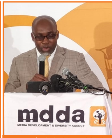
Mayor of eThekweni Municipality, Mxolisi Kaunda, addressing the audience.