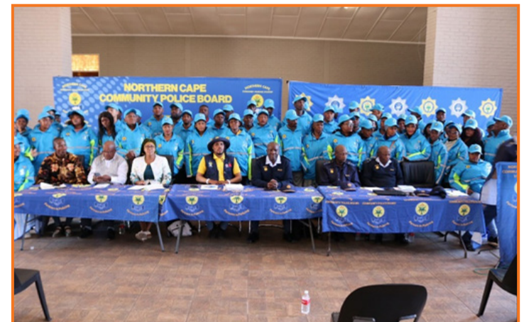
The Community in Blue patrollers at the event.