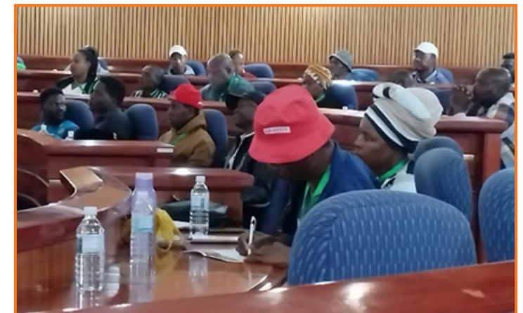
Mashiteng engaging with the attendees in KwaMhlanga.