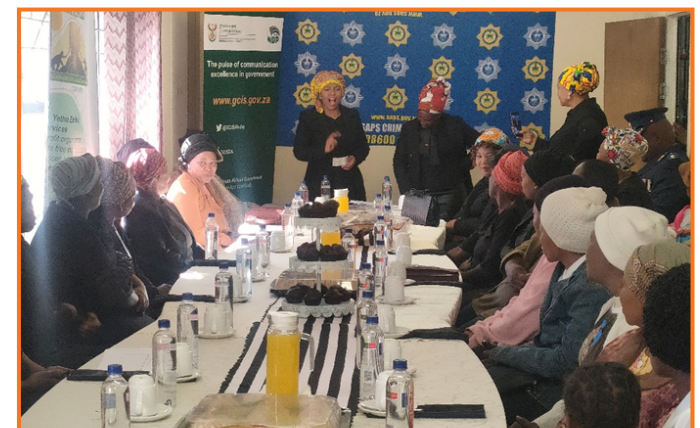
Women from Magaliesburg attending the dialogue.