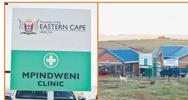
The Mpindweni Clinic officially handed over to the community of Mpindweni village.