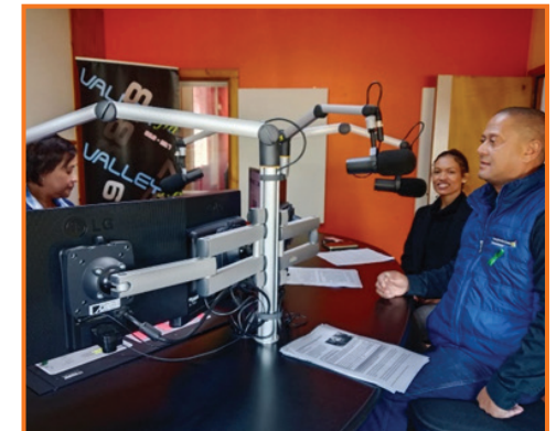
A GCIS interview at the Valley FM Community Radio Station to ensure that 171 000 people in the Valley receive key information on how to protect their children.