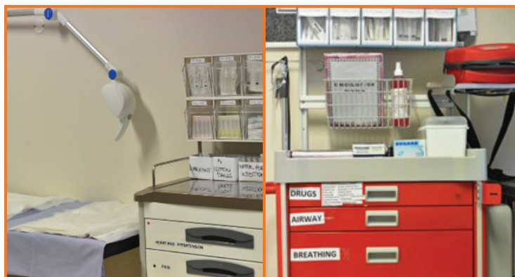
Some of the equipment at the newly built Mpindweni Clinic.

The building of the clinic contributed to the local economy of Umzimvubu by employing 35 community members during the construction phase, 40% of them being young people. During the construction phase, the project invested over R3 million towards the beneficiation of local small, medium and micro enterprises.