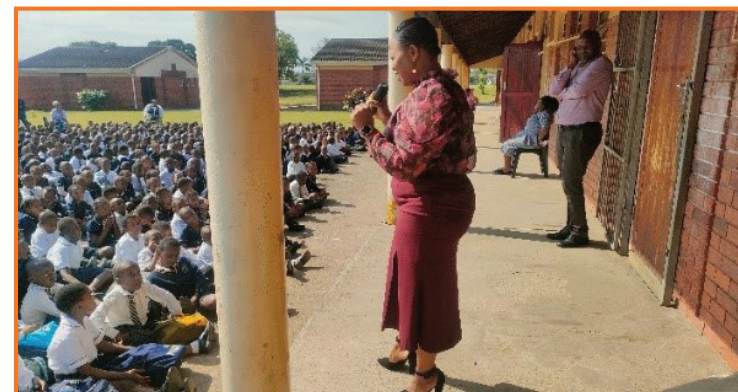
Ilembe Primary School learners listening attentively to a representative from the DSD talking with them about issues related to children's well-being.