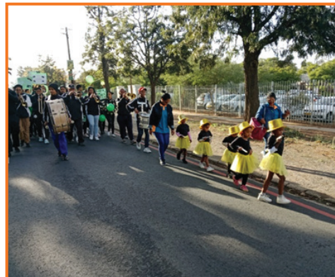
The National Child Protection Week march proceedings with the Tiny Toddlers Early Childhood Development group from the community of Roodewal in Worcester.