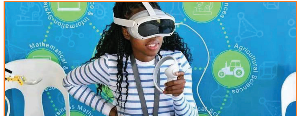
Learners experimenting with technological gadgets.