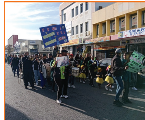
Representatives from the DoJCD, NPA, DSD and DCS, marching against child abuse.