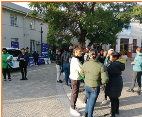
Various departments and stakeholders that formed part of the march on 31 March 2024 at the Cape Winelands District office, led by the DSD in Worcester.

More than 200 representatives from various organisations from the Cape Winelands District participated in the march against child abuse, which crossed through all the main roads of Worcester in the Breede Valley Municipality. It culminated in the signing of a pledge to ensure that parents and adults are capacitated to deal effectively with situations related to a child's development. Various media houses such as the Worcester Standard, Media24 Online and the Valley FM Community Radio Station covered the event.