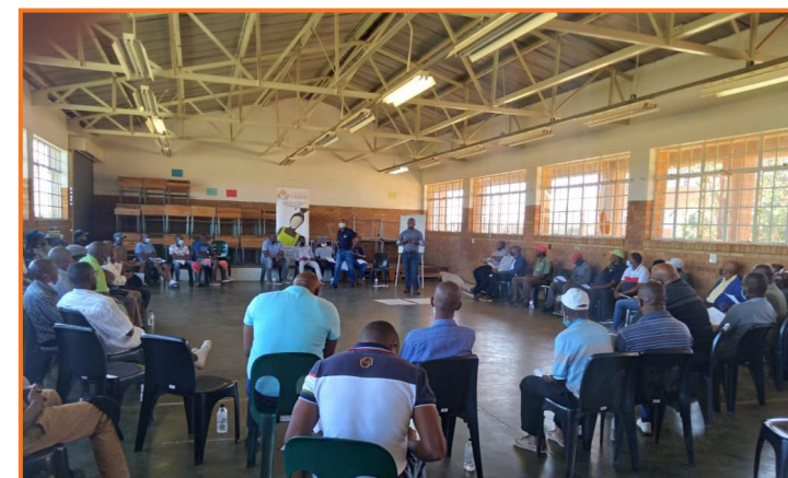
Men who attended the dialogue in Thembisa.

The centre is available on a toll-free number: 0800 428 428, USSD *120*7867# or SMS ‘help’ to 31531 or Add ‘Helpme GBV’ to your Skype contacts.