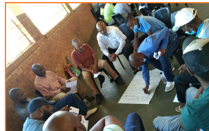
Men formed groups to discuss various topics and report back.