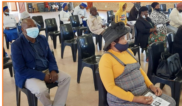
Some of the community members who attended the candlelight memorial service.

Several testimonies rendered at the event by persons living with HIV were intended to motivate community members who are struggling to accept their HIV-positive status, to be open and to accept help from various stakeholders.