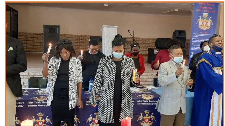
The candlelight prayer session at the event.