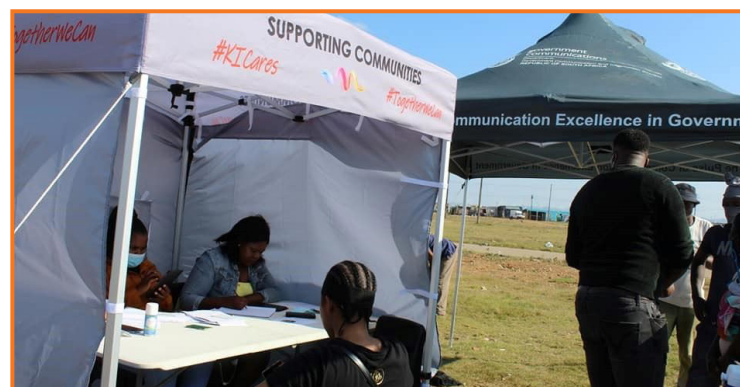
COVID-19 vaccination site at Ocean View.

Communication efforts through various communication platforms continued in the area and across the district to improve vaccination uptake.