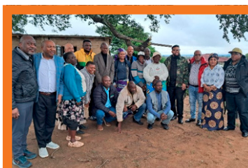
The Portfolio Committee at the Manavhela Tribal Council during a visit to assess progress with set-top box installation in the area.