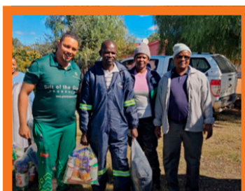
Gift of the Givers provides humanitarian relief.

Communities were urged to follow safety precautions, avoid crossing swollen rivers and flooded roads and also exercise extreme caution when travelling.