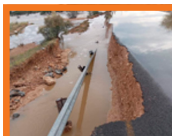
Flood damage to roads in the district.