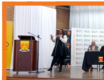
Minister Gwarube encouraged young people to persevere and not give up on their dreams.