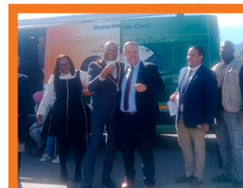
The Mayor of Stellenbosch also received the new barcoded identity document.