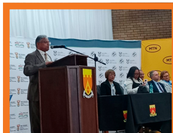
The Acting Director of Education in the Cape Winelands District welcomes dignitaries and learners to the event.

The outreach concluded with the handing over of identity documents to elderly community members in Stellenbosch, as well as the opening of a Home Affairs digital application point at the local Capitec branch in Eikestad Mall. The initiative demonstrated government's commitment to integrated service delivery and direct community engagement, while helping learners to prepare for future opportunities and addressing local service delivery challenges at a local level.