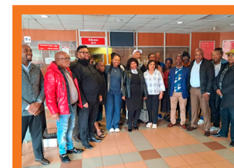
Members of the Portfolio Committee during a visit to the Sibasa Post Office.