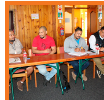
CDWs in the Cape Winelands also actively took part in the communication strategising session.