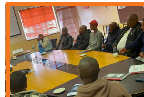
Discussions among men, stakeholders and members of the forum on how they can collaborate to assist each other.