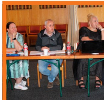
Team IEC was also present at the workshop and active participation during the session ensured a geared-up Communication Strategy.