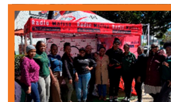
The GCIS was joined by Mafisa FM, DSD, IEC and the Moses Kotane Local Municipality at Rustenburg Mall.