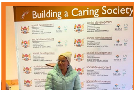
The DSD presented their programmes to the attendees and how the department could assist the Men’s Forum deal with the social ills in Hanover.