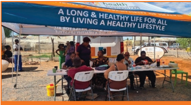
The DoH rendering services to community members, including testing and counselling.

Geraldine Thopps 021 418 0533/2307 or 081 281 2200 Geraldine@gcis.gov.za