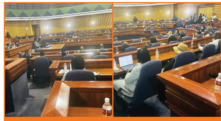
Officials, traditional leaders and community members attending the opening of the satellite office at KwaMhlanga District Magistrates Court.

Detailed investigative reports can be accessed on the PPSA website: www. pprotect.org.