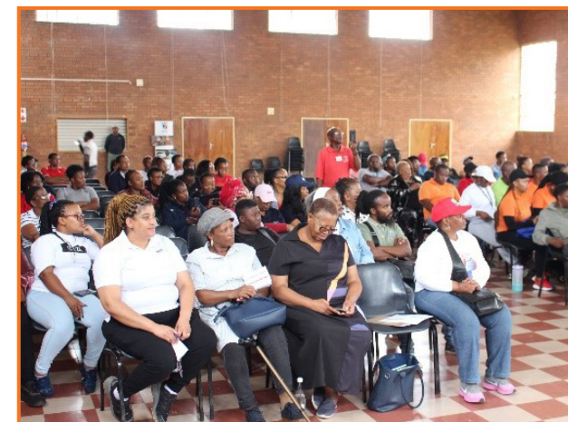
Community members of Vooslorus who were in attendance.