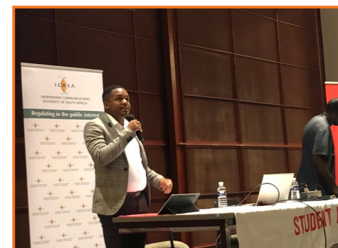
Mayor Kagiso Sonyoni engaging with the students.