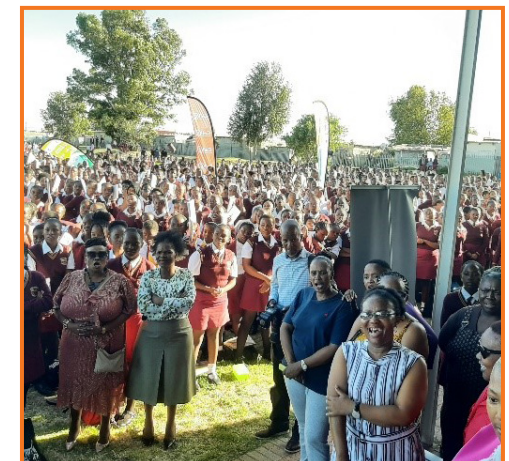
Learners and teachers during a handover ceremony of different items at the school assembly.