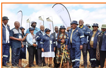
President Ramaphosa and other government officials at the site where houses will be built.