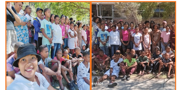
Grade 8 learners from various rural schools and their facilitators.