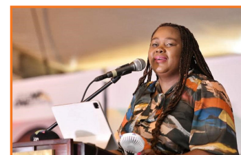
Minister Kubayi co-hosting the event with MEC Bentley Vass.