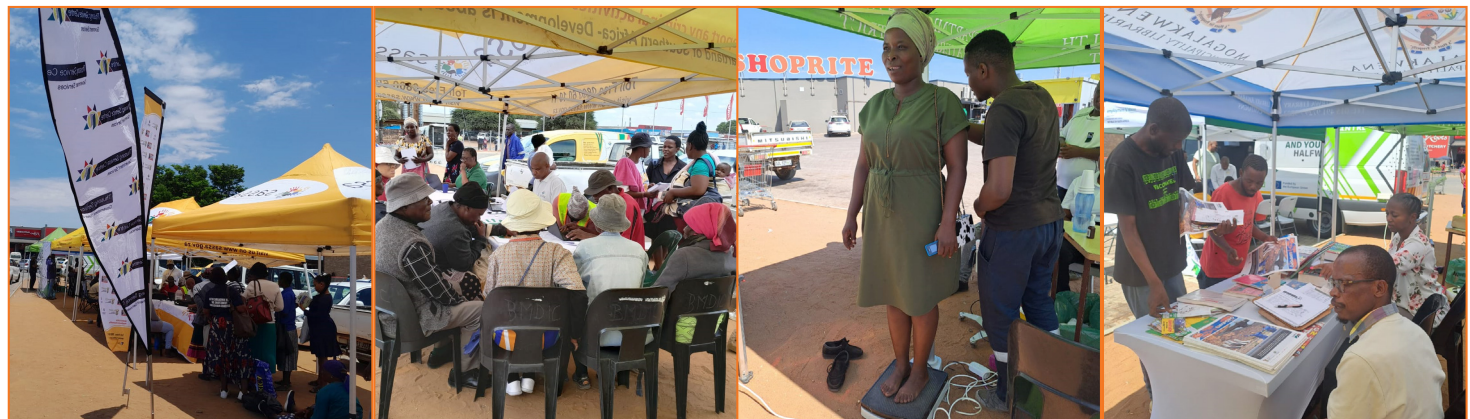
Community members who visited the stalls to access government information and services.

"I am happy that I visited the shopping complex today. I managed to apply for a social grant from and get more information on GBVF. I pay R55 to access the nearest government offices, but I have saved time and money."