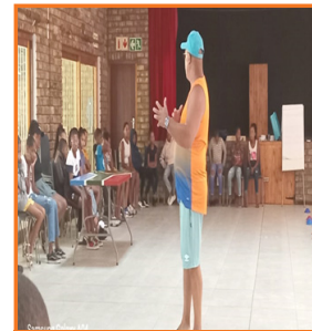
Gender-based violence dialogue with Department of Social Development and Child Welfare officials during the orientation camp.