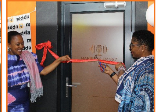
Minister in the Presidency and Deputy Minister together with MEC Rosho officially unveiling the Mahikeng FM studio.