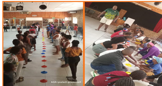
Leadership skills session with De Villiers Primary School teacher during the orientation camp.

Next year the orientation camp will celebrate its fifth year, and stakeholders are already planning a bigger one where the Minister of Arts and Culture will be invited to take part.