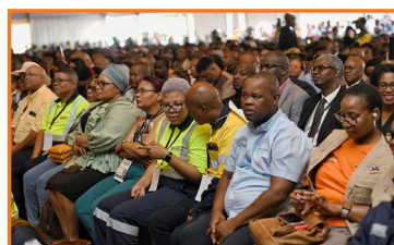
Government officials and some of the community members.

“Let us continue our work to build a South Africa in which there are houses, security