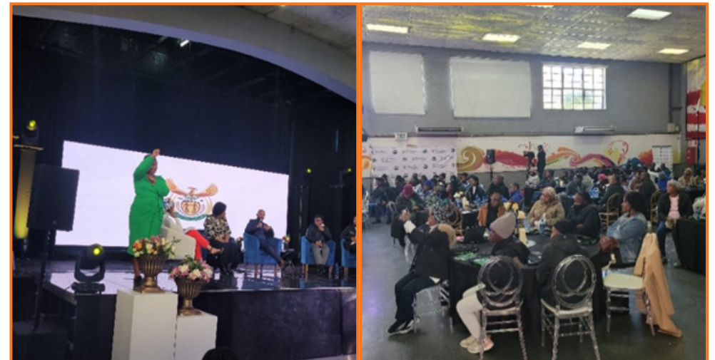
Community members of Ward 39 and surrounding areas listening to panel discussions during the dialogue.