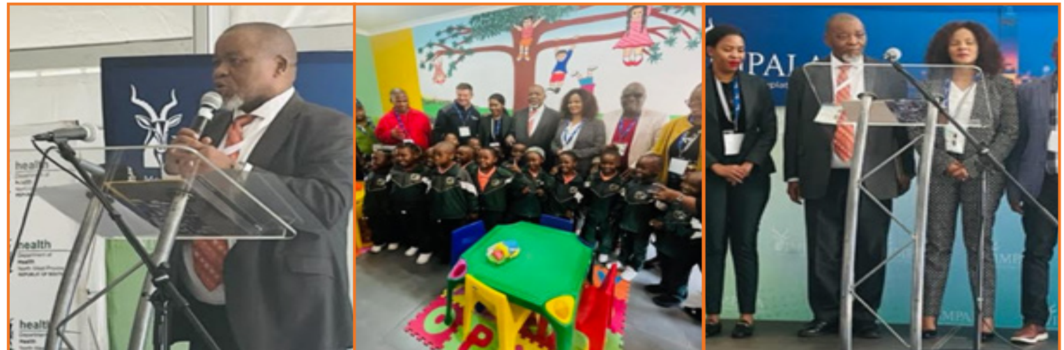
Minister Mantashe opening and handing over the clinic at Freedom Park.

As part of its Social and Labour Plan, Impala Mine led and funded the construction of both the clinic and ECD centre.