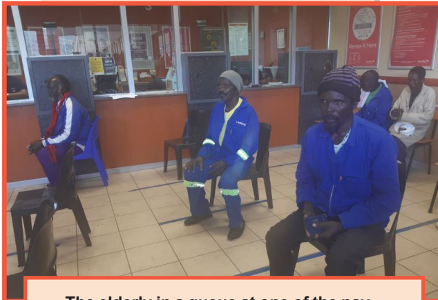
The elderly in a queue at one of the pay points in Umzinyathi District.