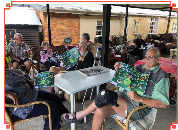
COVID-19 public awareness campaign.