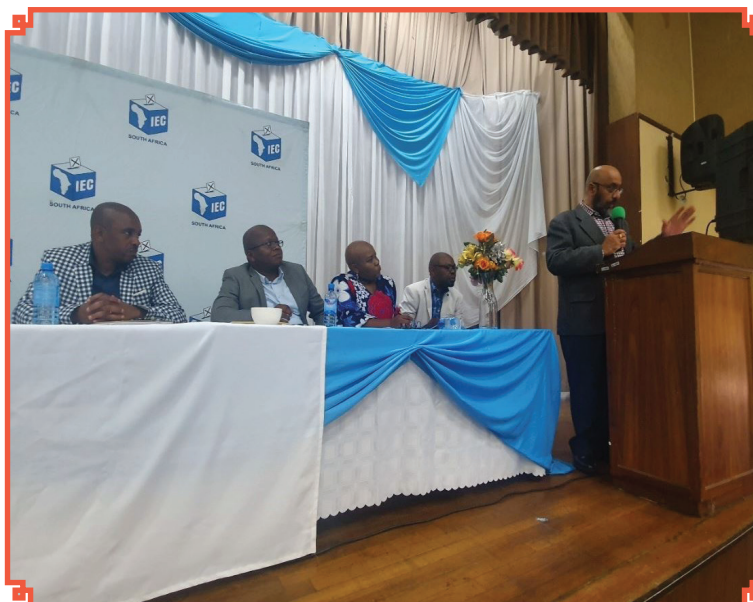
Different stakeholders at the event.

"We also want to make sure that our democracy is strengthened and balanced. We want people to make informed decisions when going to the polls, and as the IEC, we keep on educating people about their rights through community outreach programmes," said an official from the IEC.