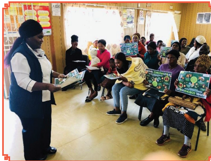
A health official educating patients about COVID-19.

Communities were empowered on how to prevent and curb the spread of the virus and also told not to panic but avoid fake news and misleading information. The community members and patients were urged to practice good hygiene and wash their hands regularly using soap for 20 seconds or use sanitisers where there is no water.