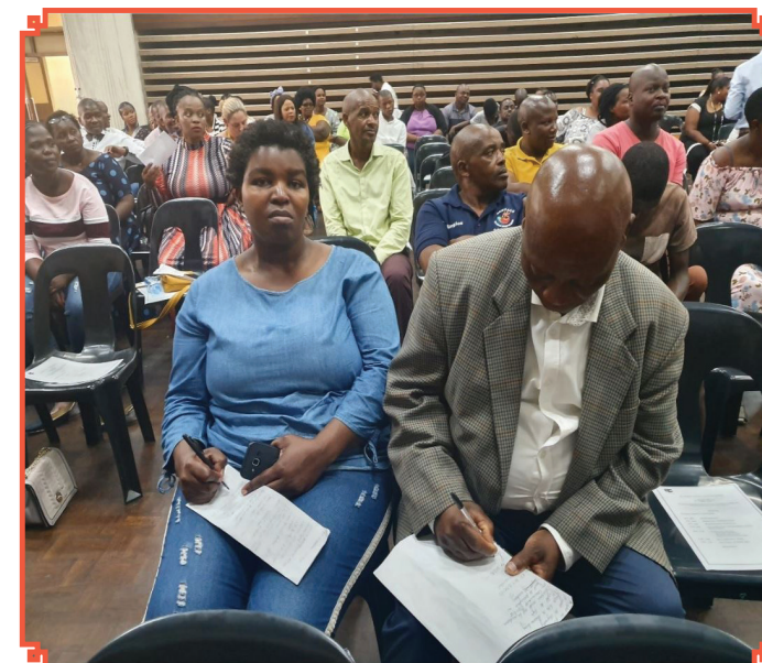
Representatives from various formations attending the seminar.