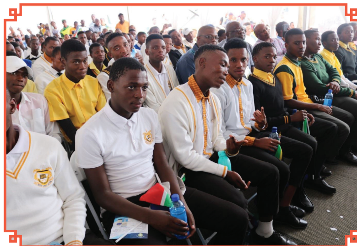
The young men who attended the dialogue.

Two of South Africa’s renowned actors, Menzi Ngubane and Presley Chweneyagae, were given a platform to engage with the participants on how men should treat women and children. Ngubane emphasised the importance of young men knowing that women should be respected and understanding that no one should think that he/she owns another human being, because that is what usually leads to abuse.