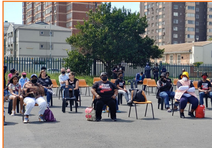
Members of the KwaZulu-Natal Human Trafficking, Harmful Practices, Pornography, Prostitution and Brothels Task Team engaging with the community members.