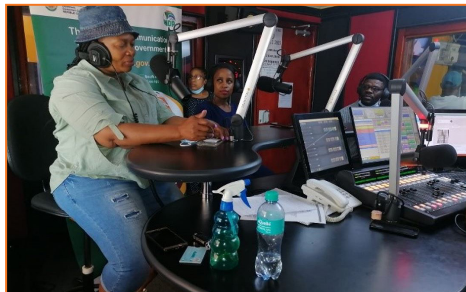
Community radio engagement on disability rights at Mosupatsela FM.

Disability Rights Awareness Month focuses is a platform to report back by government on plans and initiatives to equalise opportunities for persons with disabilities, and on acknowledging the role of persons with disabilities in socio-economic development and nation-building.