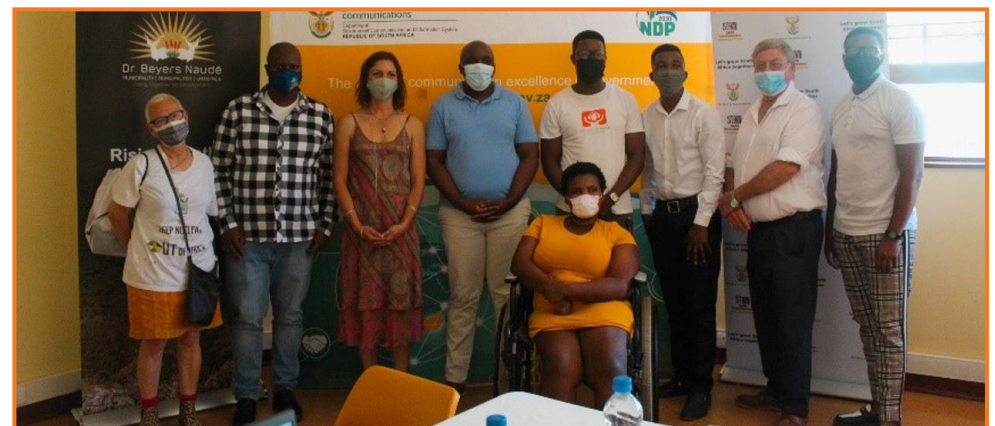
Community stakeholders who have been appointed for establishing a radio platform.