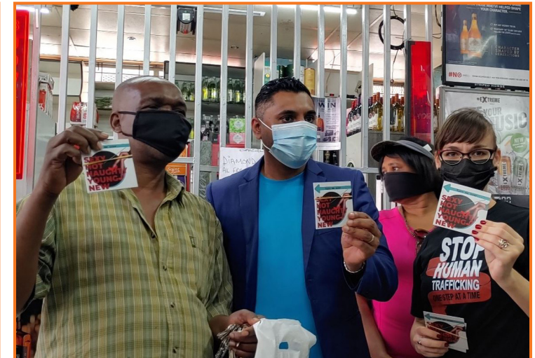
Engagement with management of bars, restaurants and pubs in the Durban City Centre about human trafficking.