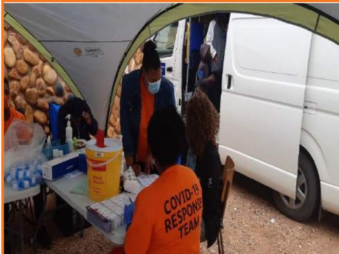
Consultations on the COVID-19 screenings and tests in Malgas.