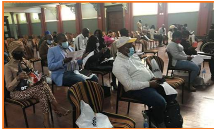
Community media representatives from various media houses who were in attendance.

The Media Development and Diversity Agency (MDDA) in partnership with the Government Communication and Information System (GCIS) in the Eastern Cape conducted a provincial funding outreach programme in East London. It was aimed at educating and informing potential and existing MDDA applicants about the agency's new funding processes introduced last year, and also compliance requirements. This outreach programme runs parallel with the call for grant funding applications, which took place from 15 October to 30 November 2020.