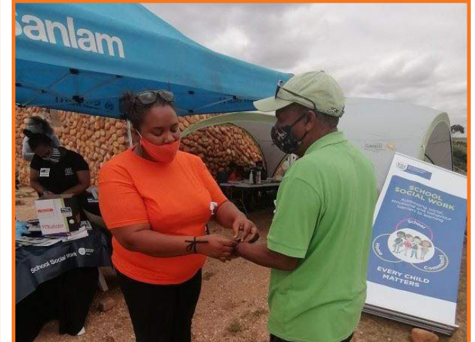
Attendees were urged to wear black or a black ribbon.

The launch of the 16 Days of Activism for No Violence against Women and Children was held in a very small community called Malgas, outside Swellendum on 25 November 2020. This year, the focus was on the smaller communities that are not easily reached by government services, compared to the communities in bigger towns. The town of Malgas consists of just 30 small houses, with most families relying on government grants as an income. The biggest challenges in the community are drugs, alcohol and substance abuse, which lead to domestic violence, in most cases.