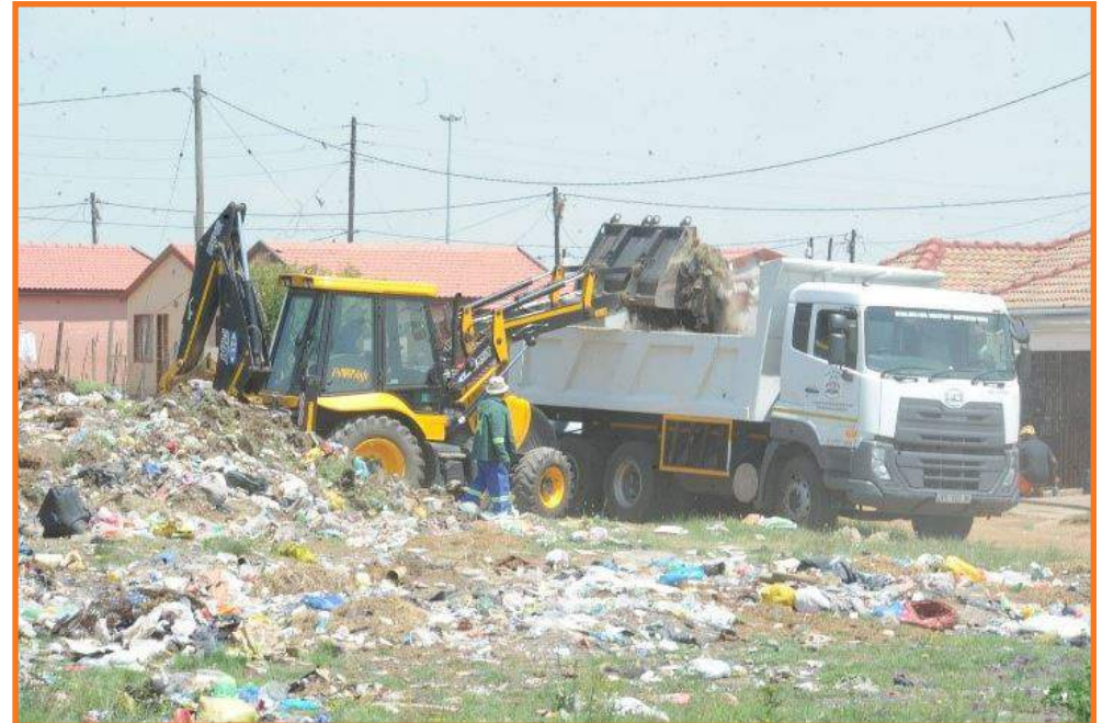
Cleaning up at Mdluli and Mkhwanazi streets in an effort to tackle illegal dumping in Msukaligwa Local Municipality.

In an effort to support local municipalities to create and maintain cleaner and healthier environments, the Government Communication and Information System supported the Municipal Health and Environmental Services of the Department of Community and Social Services at the Gert Sibande District Municipality in running cleaning campaigns, which started in Msukaligwa Local Municipality. The first one was conducted in Ward 6 on Mdluli and Mkhwanazi streets on 29 October 2020, followed by another initiative in Ward 3 on Oosthuise Street, which took place on 19 November 2020.