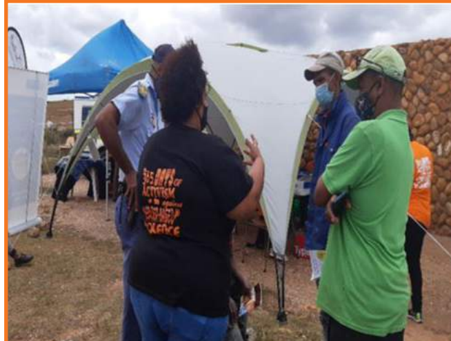
Stakeholders engaging with community members at the event.