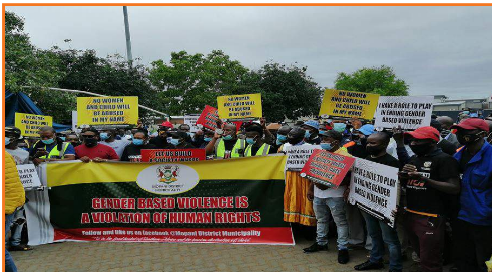
Men of Giyani who participated in the march.

The Executive Mayor of Mopani District Municipality Councillor Pule Shayi led a men’s march against gender-based violence and femicide (GBVF) in Greater Giyani on 20 November 2020. The event was observed under the banner: “Gender-based violence is a violation of human rights”. Mayor Shayi urged a huge number of men and boys to abstain from GBVF. He persuaded them to respect themselves by leading an honest life with high morals and integrity. The Mayor further urged men to lead by example in their households as father figures.