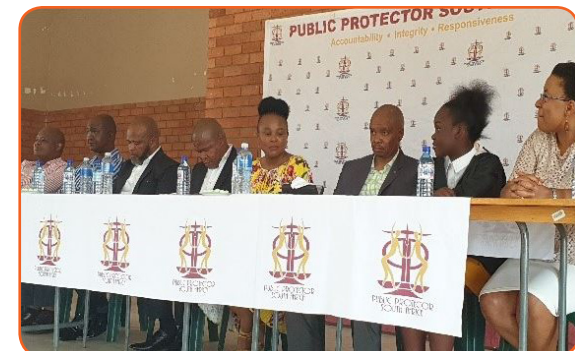
The Public Protector and other stakeholders engaging with the public

The Public Protector, Advocate Busisiwe Mkhwebane, visited the Dipelaneng-Hobhouse in Free State on 5 November 2019. This was part of the Public Protector Annual Stakeholder Roadshow which was held under the theme: "Governance and Ethics."