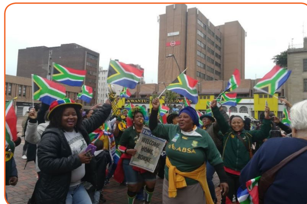
Community members singing and dancing while waiting for the Springboks to arrive.