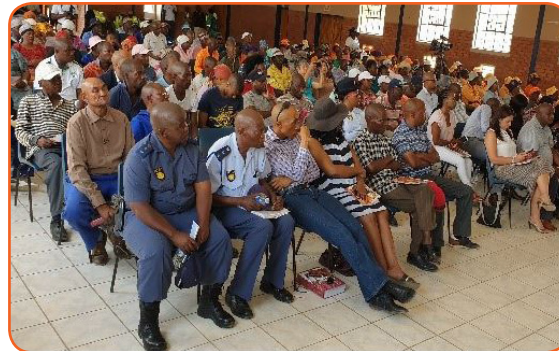
Community members who were in attendance.