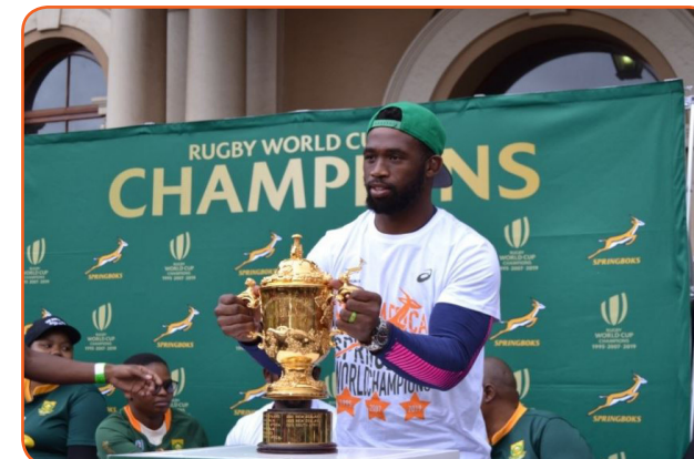
Siya Kolisi with the Webb Ellis Cup outside the City Hall in Nelson Mandela Bay.