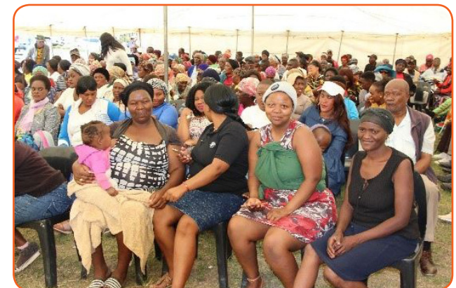
Community members who attended the session.