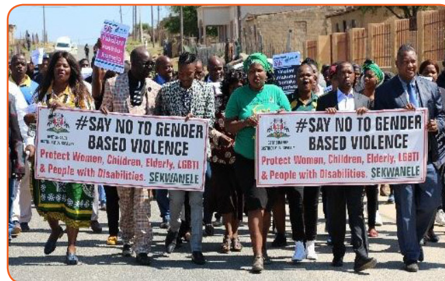
Mayor Muzi Chirwa and Mayor Dan Nkosi leading the street march.