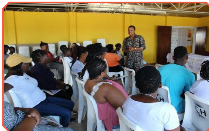
NYDA official interacting with the audience.

The President said that in order to find solutions to unemployment, government, together with business, labour and communities must "continue to meet at the beginning of every month to remove blockages and drive interventions that will save and create jobs". He further added that the NYDA and the Department of Small Business Development would provide grant funding and business support to 1 000 young entrepreneurs in the next 100 days.