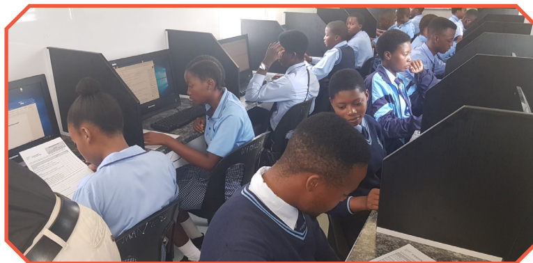
Manhlenga Secondary School learners during their computer literacy training.