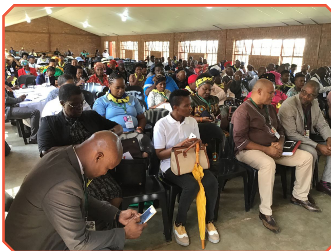
Some of the people who attended the launch.

The Premier concluded by urging all citizens to support the President's vision for development. "This vision will grow Limpopo and South Africa as a whole. In so doing, we will indeed be growing South Africa, district by district," he concluded.