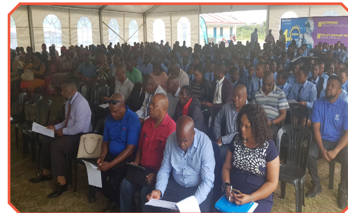
Stakeholders, parents and learners who attended the launch programme.