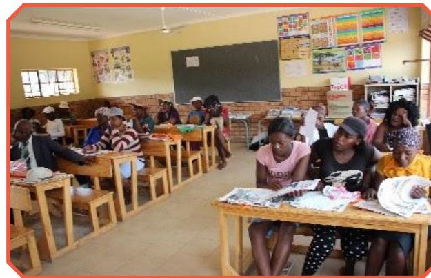
Some of the community members who attended the session.

Information materials on gender-based violence were shared with the public, and the Insession and Vuk'uzenzele newspapers were also distributed to community members.