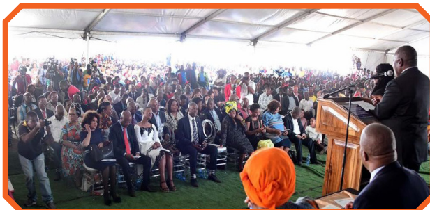
Dignitaries and community members attending the launch.

The launch was attended by approximately 10 000 community members from all over OR Tambo District Municipality. The President is also expected to launch the model in KwaZulu-Natal on 18 October 2019.