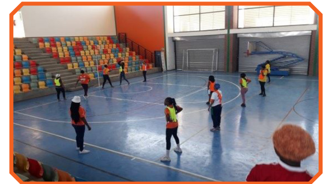
Indoor Netball final match.