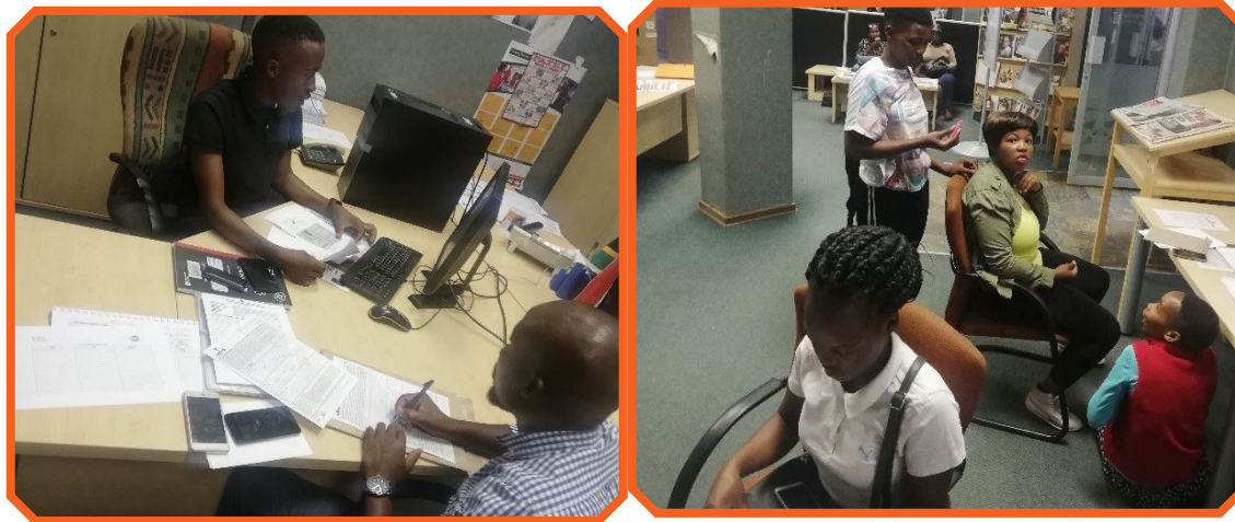
Young people applying for NSFAS.

"I am happy with your services. I hope I will get funding"