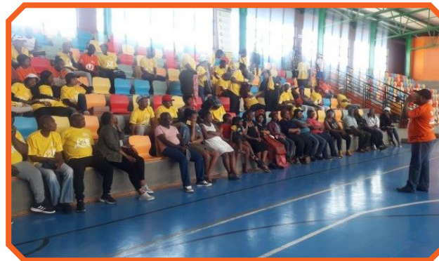
community members listening to the memorial lecture.

"It was great being a part of this event. I hope it grows bigger as the years go by."