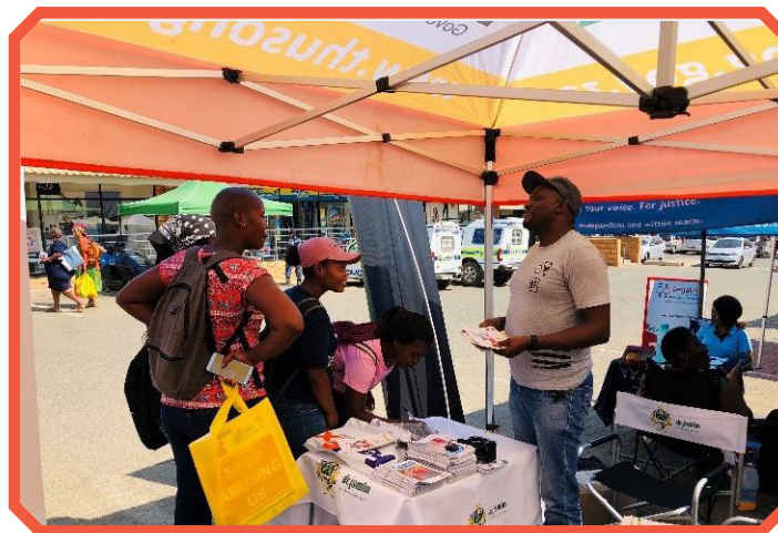
Community members receiving government services during the outreach.

Stakeholders included the departments of Social Development, Basic Education, Sports, Arts and Culture, Home affairs, Labour, and Cooperative Governance and Traditional affairs, the South African Police Service, the South African Post office, the South African Social Security Agency, the Independent Communications Authority of South Africa, the Road Accident Fund, the Legal Aid Board, the Office of the Premier, Moutse Community Radio Station, the Dr JS Moroka Local Municipality and non-governmental organisations, Age in action and Tirisano.