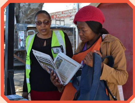
A government official sharing information with a community member.