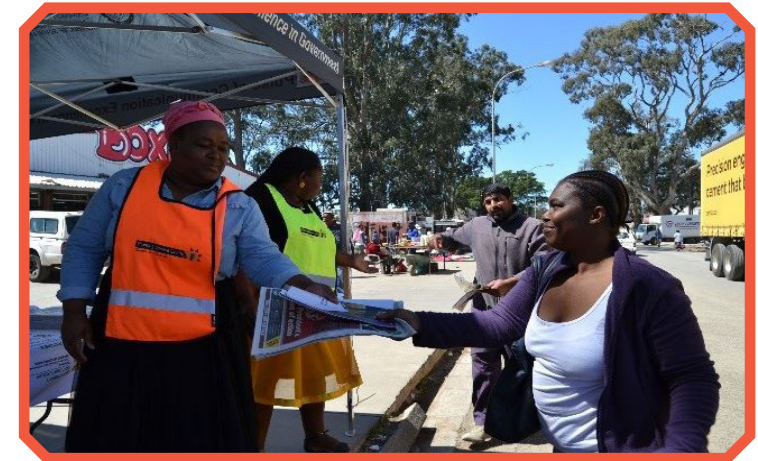
Officials distributing information material to the people of Centane.