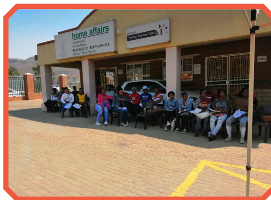
Community members attending the event.

Applications for the NSFAS can be done online on: http://www.nsfas.org.za/content/how-to-apply.html . Those hoping to get funding have until 30 November to apply.