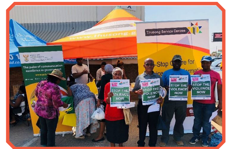
Men and women taking a stand against GBV.