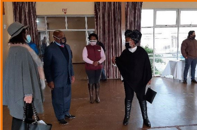
MEC Mbombo engaging Deputy Minister Phaahla on the readiness of the resort.