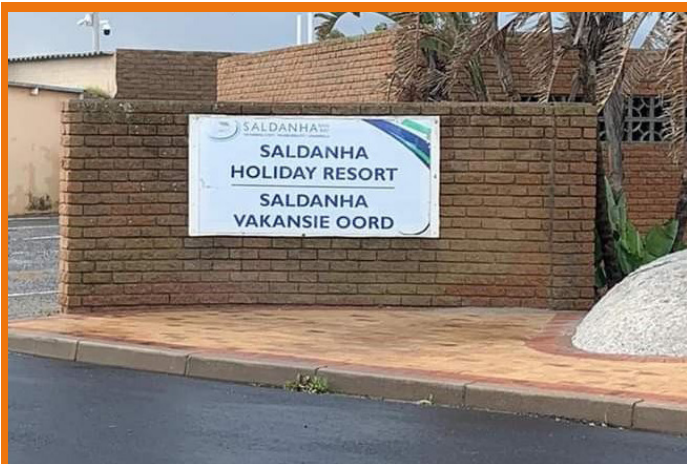
The Saldanha Holiday Resort is used as an isolation facility for COVID-19 patients.