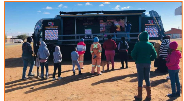
Truck activation in Galeshewe where people were informed about the COVID-19 vaccination programme.