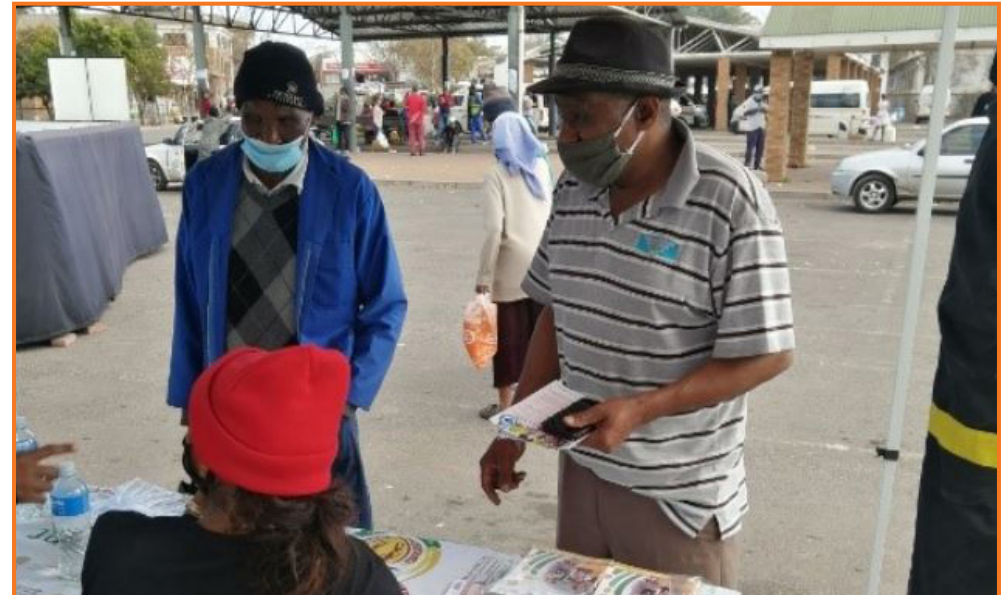
Elderly people registering for the COVID-19 vaccination.

The Government Communication and Information System hosted a COVID-19 registration and vaccination awareness campaign through a mobile truck roadshow at Grabouw Taxi Rank on 8 June 2021.