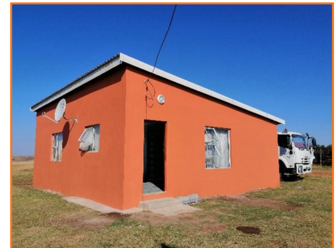
Noprivate Peter's house that was built by inmates.