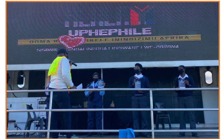
Learners given information on how to register elders online for vaccination.

The Government Communication and Information System in collaboration with the Mpumalanga Department of Health, conducted truck activations on COVID-19 vaccine registration on 7 June 2021 in Waterval Boven and Siyathuthuka at Emakhazeni Local Municipality.