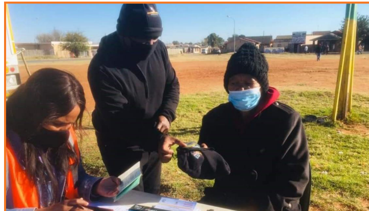
A government official registering an elderly for the COVID-19 vaccine in Galeshewe.

The youth were encouraged to assist their families and neighbours to register for the vaccine, using their mobile devices. During these events, stakeholders registered many elderly people for the vaccine, using their personal cellphones. Information leaflets and promotional material were also distributed at the events.