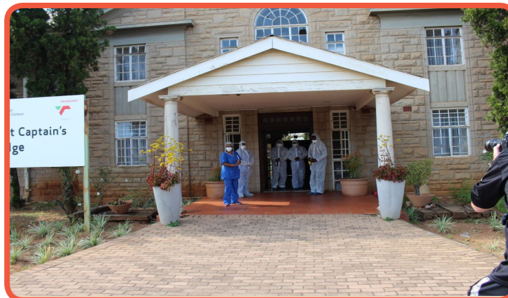
Health workers welcoming guests at the Esselen Park quarantine site.

The visit included a walkabout to monitor compliance to lockdown regulations in the area, and mass screening and testing at the Evergreen Fruit and Vegetable Centre in Esselen Park.