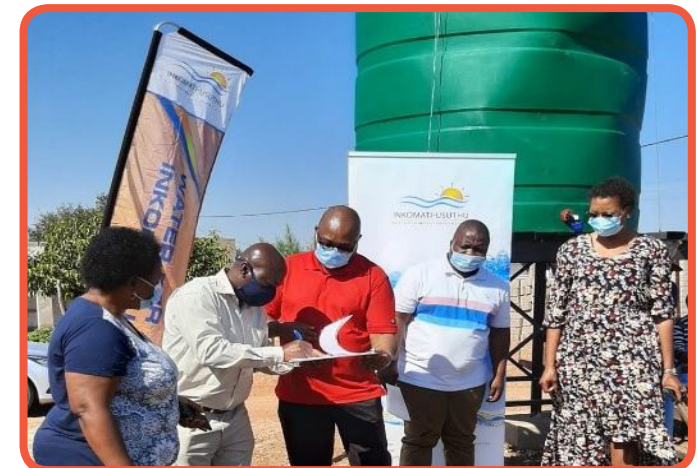
Officials acknowledging the installation of the JoJo water tanks.