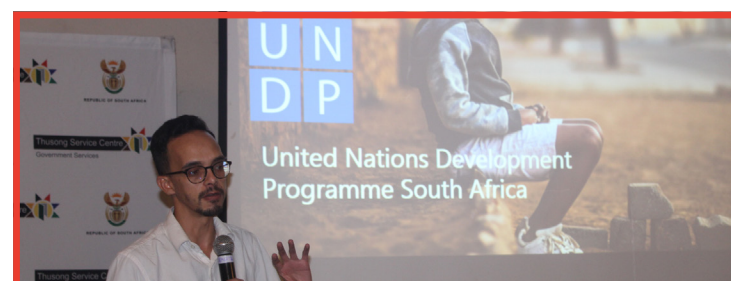
UNDP presentation on proposed programmes to collaborate with Thusong Service Centres