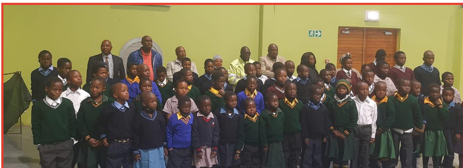
Learners from various primary schools received school uniform.

The schools that benefited from this initiative included Mthende Primary, Sokesimbone Primary, Nsebenzwenhle Primary, Nsetheni Primary, Ebusingatha Primary, Insukangihlale Primary, Vulamehlo Primary, Inkosi Nogaga Primary, Crowfield Primary, Hambrook Primary, Nokopela Primary, Ebojeni Primary, Nomtshilo Primary and Bethany Primary.