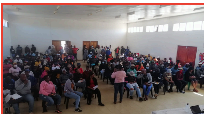
Community members accessing services at Victor Tong Thusong Hall.

Vitae in preparation for employment opportunities. In addition, Small Enterprise Development Agency and National Youth Development Agency were part of the outreach capacitating the youth on entrepreneurship and other opportunities to build the economy. Approximately 170 young people were registered on the database for employment and business opportunities.