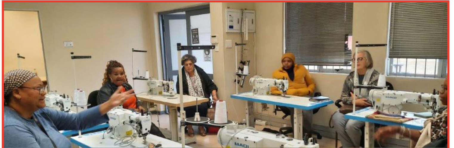
A sewing committee group with delegates from municipality, designers from Mossel bay and funders of the project discussing sustainability strategy.

Western Cape Department of Local Government funded many economic projects in Thusong Service Centres in the province to assist in improving the lives of the people for better.