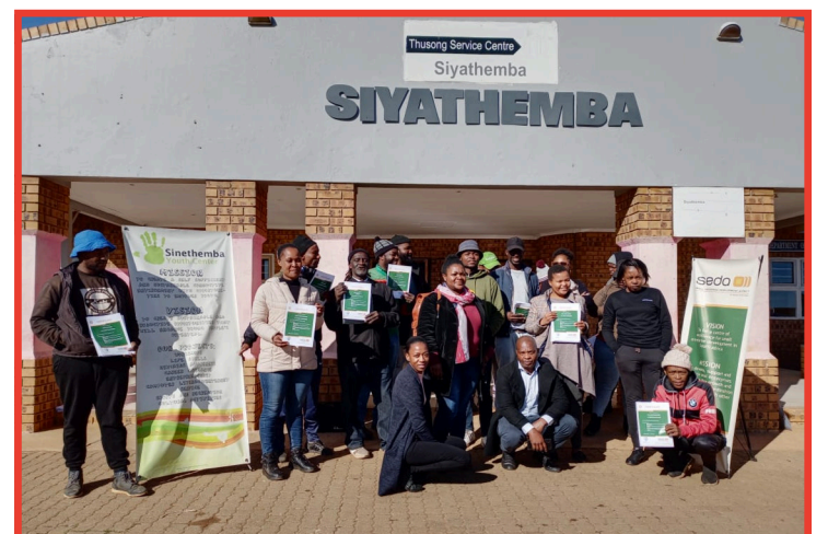
Aspiring community entrepreneurs attended entrepreneurial training and received certificates.

In addition, the National Youth development Agency further assisted the entrepreneurs with funding applications.