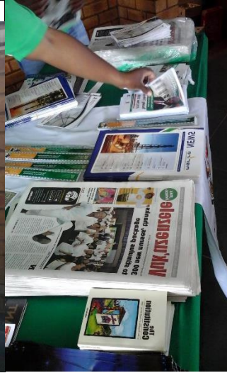
Community members with some of the publication materials received during the activation.