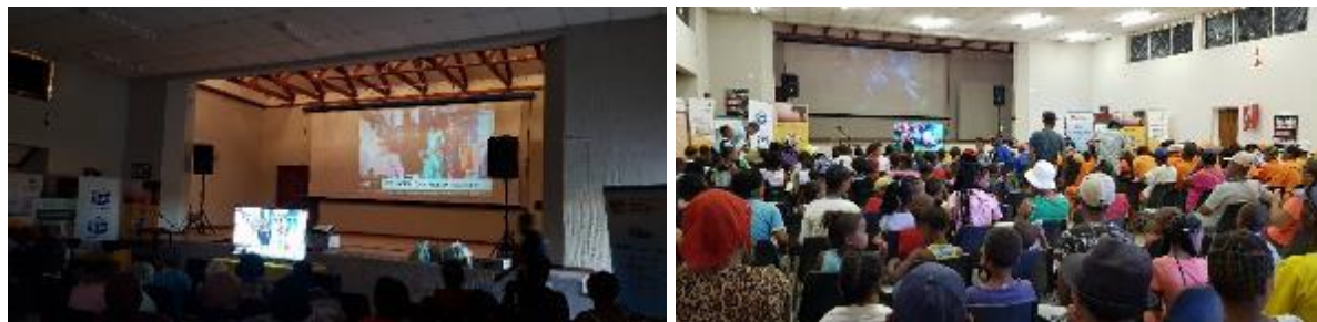
SoNA Live viewing event in Fraserburg in Karoo Hoogland.