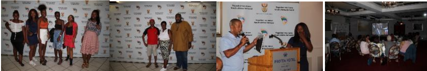
Some of the people who attended the SoNA Live viewing event. Community members watching the State of the Nation Address