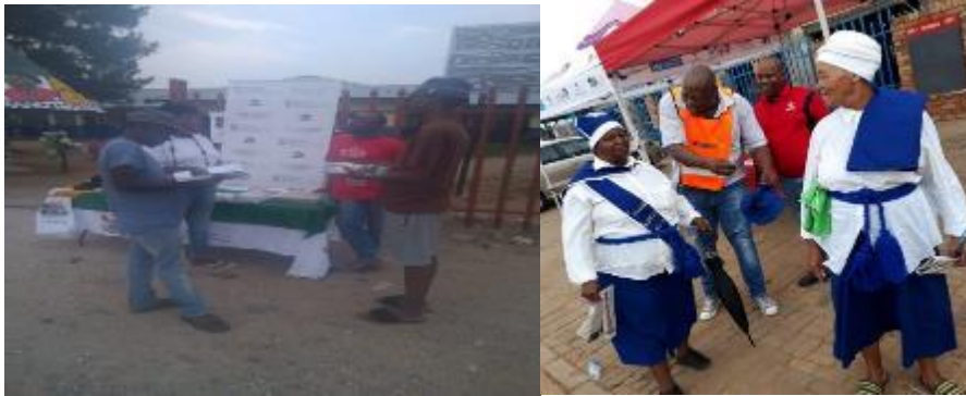
Pre SoNA mobilisation activation at Lonely Park in Mahikeng and at Khuma Shopping Complex in Matlosana Local Municipality