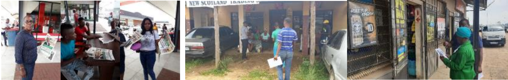
New Scotland Shopping Complex SoNA activation. GCIS official creating awareness on 2019 SoNA at Lothair Shopping Centre.