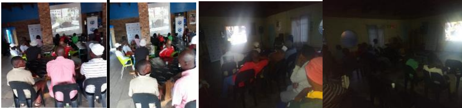
SoNA Live viewing at Kanana Township at Matlosana Local Municipality. SoNA Live viewing in Lonely Park, Mahikeng.