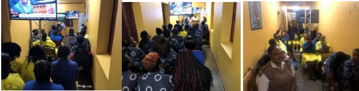
Female offenders and officials at Middelburg Correctional Centre watching SoNA.