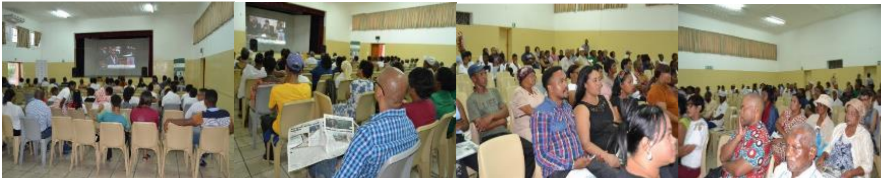
People who were in attendance at the SoNA Live viewing event.