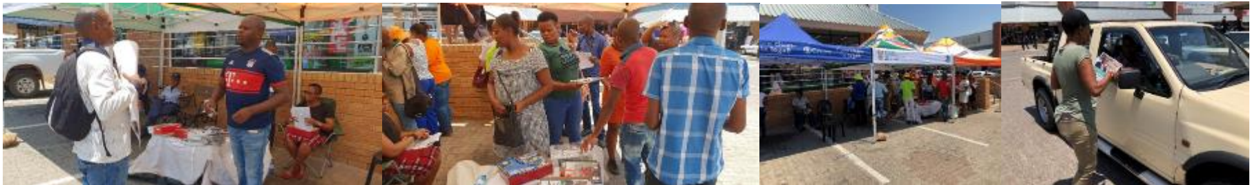
Mall activation on Pre-SoNA mobilization at Siyabuswa Mall