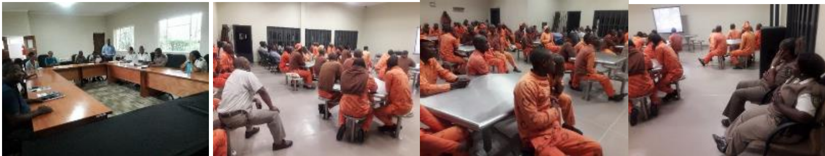
Stakeholder briefing session before live viewing at Standerton Correctional Centre. Offenders attentively listening to the President during the SoNA big screen live view at Standerton Correctional Centre.