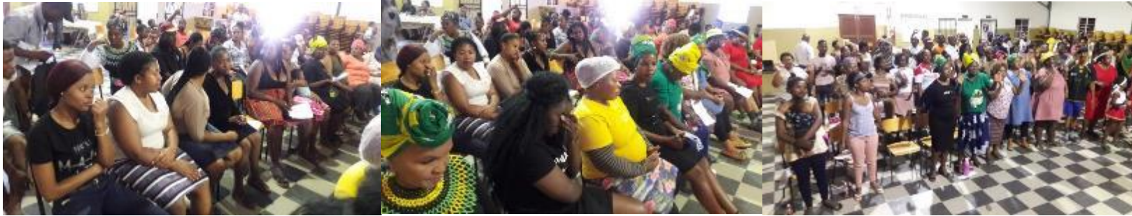
People who attended SoNA Live viewing event.