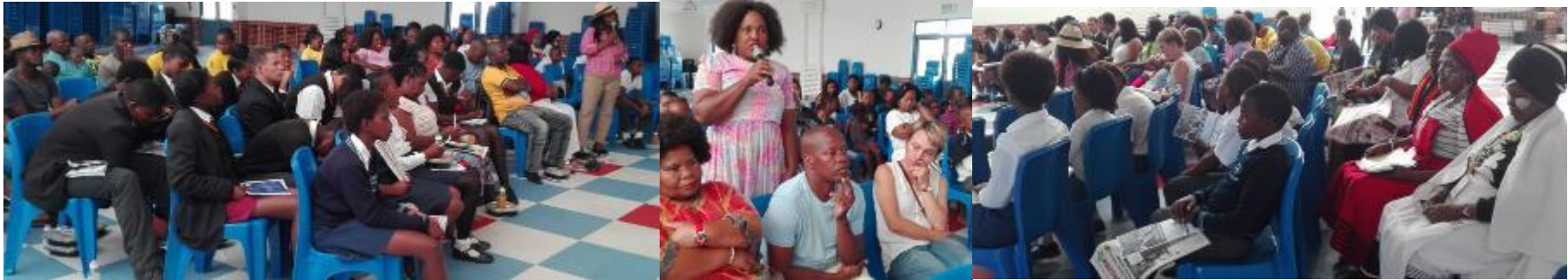
SoNA Live viewing event at Gansbaai.