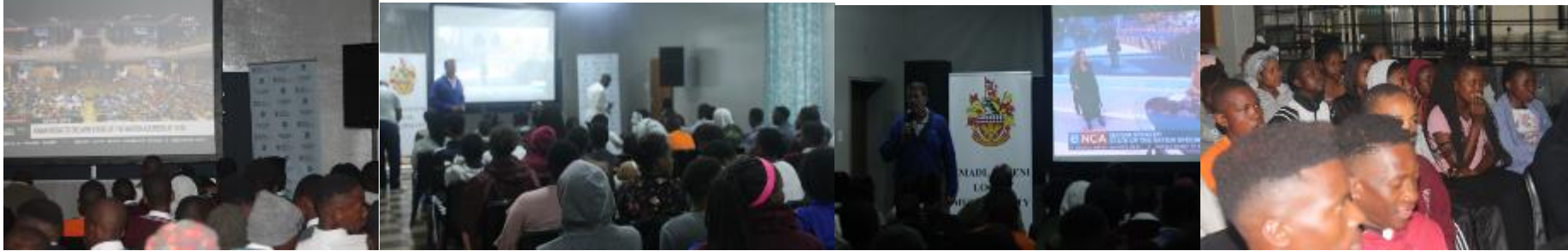
Utrecht High School learners, educators, School Governing Body and stakeholders during the live screening of the SoNA.