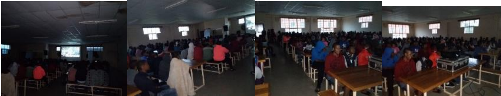
SoNA Live viewing at Zululand.