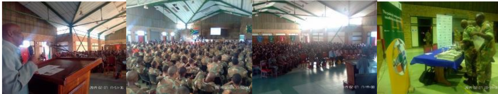
Sol Plaatje Municipality Executive Mayor Patrick Mabilo addressing the new army recruits at the SANDF base in Kimberley during the live viewing of SoNA.