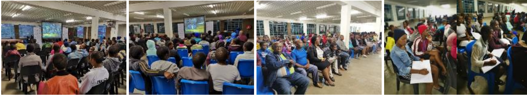
The hall full into capacity during the live screen broadcast at Msinga High School. Msinga leadership and teacher in the front attentively listening to the live SoNA. Learners making notes on the key aspects of the SoNA 2019.