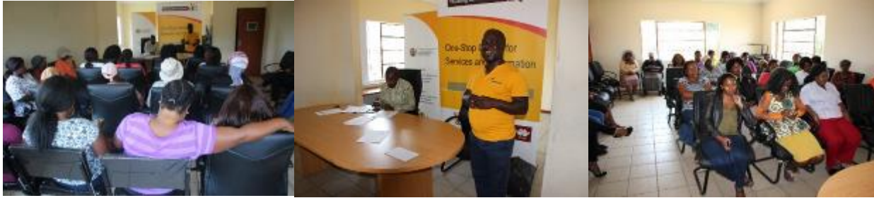
Pre-SoNA community awareness information activation at Mpuluzi Thusong Centre, at Fernie A.