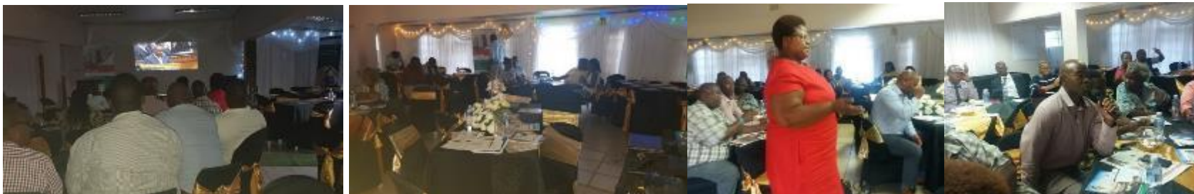
Community members participating in discussions during a SoNA dialogue and live viewing event in Colesberg.