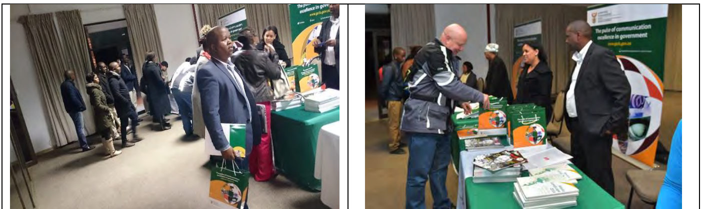
Arrivals and registration of attendees at the exhibition tables