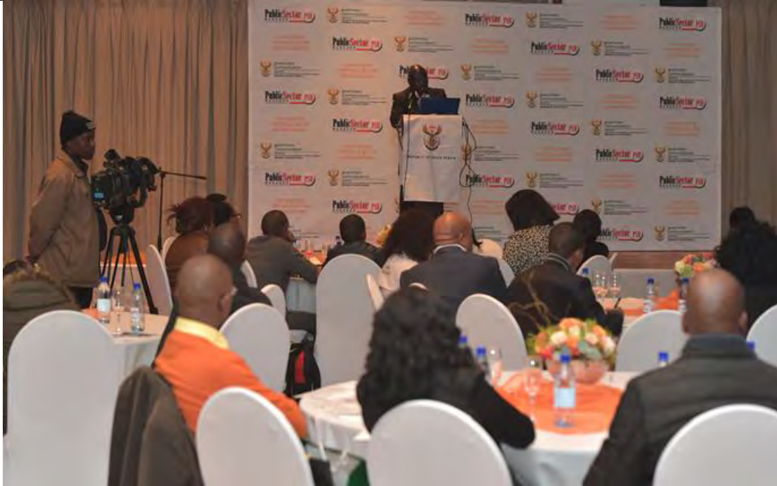
Acting DG giving the keynote address at the PSM Forum on Digital Migration