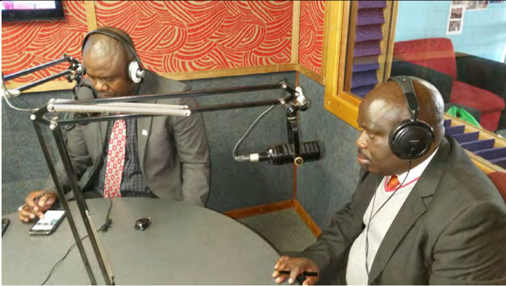
Acting DG of Communications and Chief Director Digital Migration Programme during a radio interview at Teemaneng FM