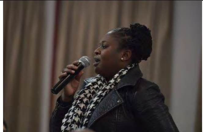
Attendees raising questions and comments on the Acting DG's presentation