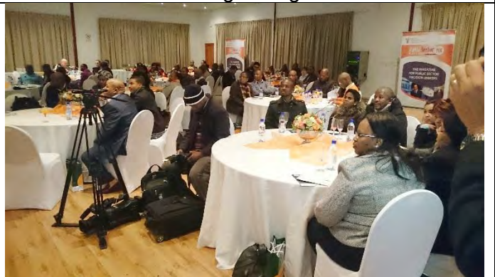
Attendees listening to the presentation by the Acting DG