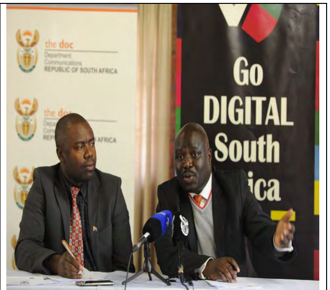
Acting DG of Communications and Chief Director Digital Migration Programme during the media session