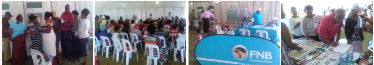
Residents of Lwandle accessing services and information from different service providers.

The Department of Communications and other stakeholders rendered their services on a three-day community outreach programme which took place from 24 to 26 February 2015 in Strand, in the Western Cape. The outreach programme targeted semi-rural communities such as Nomzamo, Lwandle, Sir Lawry's Pass and Macassar.