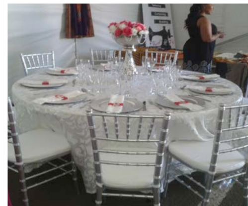
A businesswoman showcasing her events-management company.