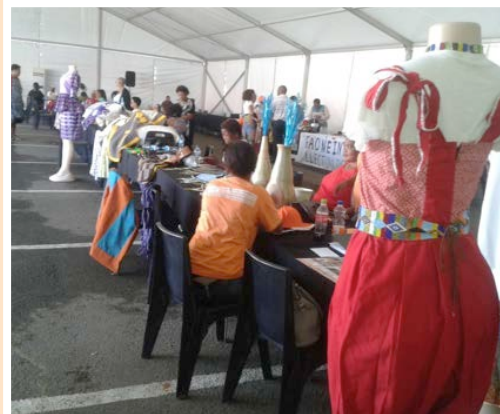
Various entrepreneurs exhibiting their products.

"I deal with chilly bites but now I have diversified into droe-wors and biltong. I purchase beef, cut and spice it and then let it dry. I would like to thank SEDA for their assistance, had it not been for them I would not be where I am today. A friend of mine referred me to SEDA and the officials were very friendly and helpful. They assisted me with branding, marketing, development of a business plan and referred me to different funders. Every time I encounter difficulties, I go back to SEDA to seek assistance."