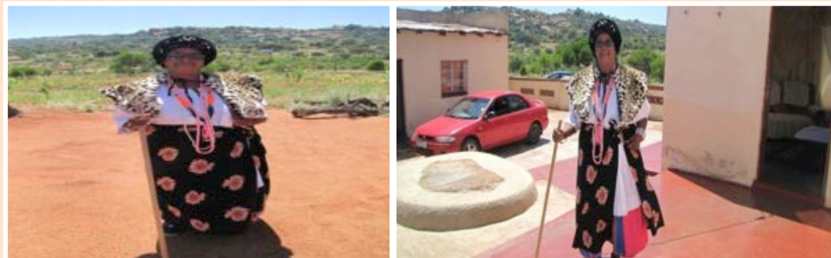
The praise poet at her home.