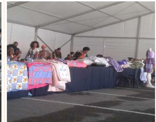
Various small businesses at the event.