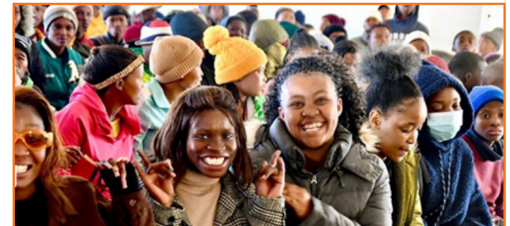
Some of the youth in attendance.