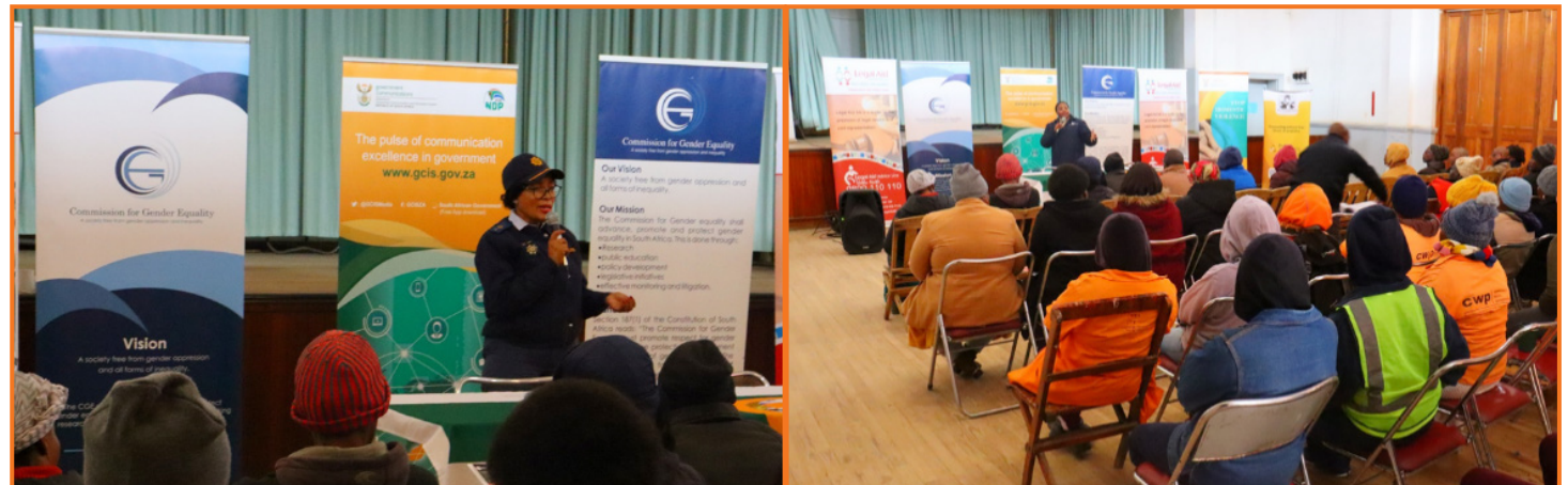
A member of the SAPS engaging with members of the public.

“As Legal Aid South Africa, we are representing the victims of all crimes, including Gender-Based Violence. Information sharing sessions like this one are important for our communities and for us to understand the roles of other stakeholders.”