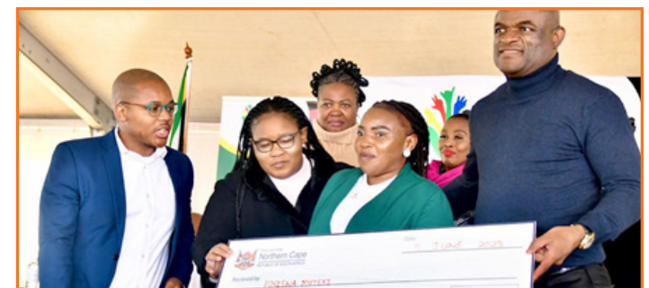
The provincial government handing over cheques to support small businesses.