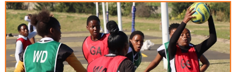
Netball teams battling it out at the event.