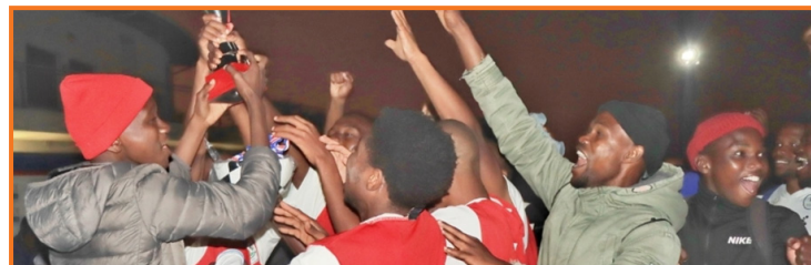
Cluster 2 Football Club scooped the overall winners' trophy and medals for the soccer instalment.