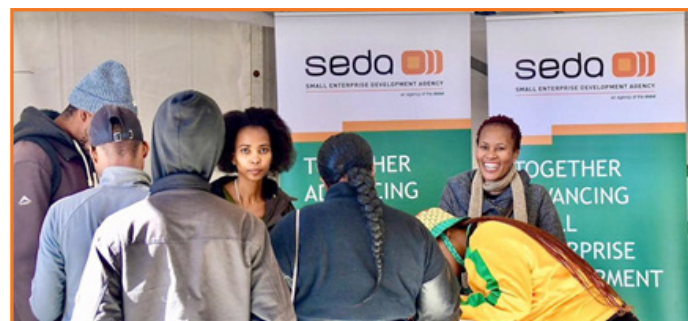
Government department and agencies which exhibited their products and services during the event.