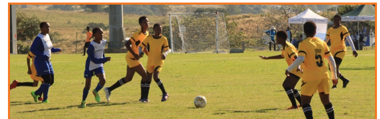
Soccer teams participating in the Ray Nkonyeni Municipality Fun and Games Sport event.