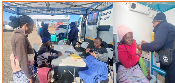
Health officials engaging with the youth and also administering the flu vaccine.

Health services such as birth control and flu vaccine injections were provided for the community. Government information contained in the latest copy of Vuk’uzenzele was also distributed and the youth were encouraged to download the Vuk’uzenzele App to look for programmes that they can use to improve their lives.