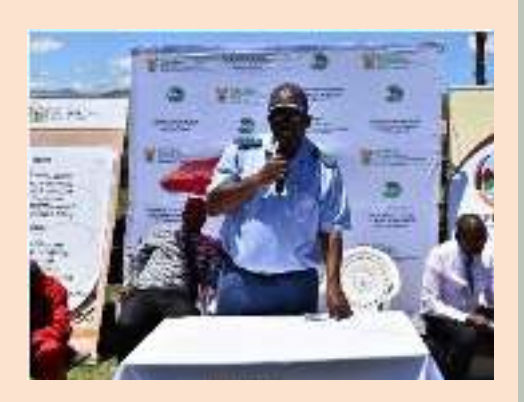
Member of the SAPS addressing the community members.

Community members raised other issues of concern in line with service delivery and government departments committed to have an evaluation meeting and consider issues rased and report back to the community.