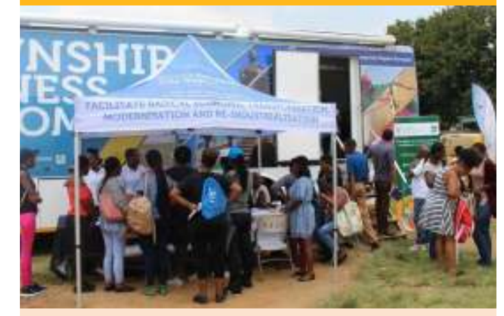
Youth visiting exhibition stalls at the event.

Youth exposed to skills development programmes By Jacob Molete: GCIS, Gauteng