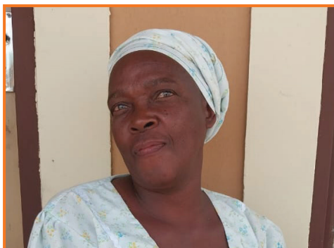
Martha Nkokwane said:

Furthermore, Deputy Minister Kekana reiterated that although some challenges are not addressed, progress has been made. On issues of electricity, Eskom will only come once everything is at 80% completion and already. Deputy Minister Kekana further went on an oversight visit at Badibana Secondary School, and to Sereti agricultural facility and Deelpan community clinic and showcased the National Flag as part of Human Rights Month.