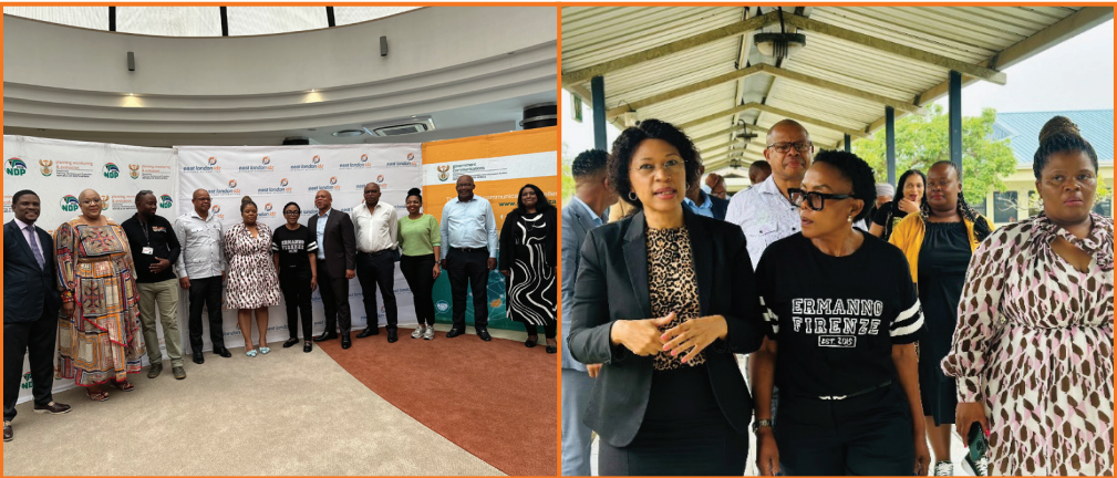
The Deputy Minister and the delegation during the frontline monitoring visit.