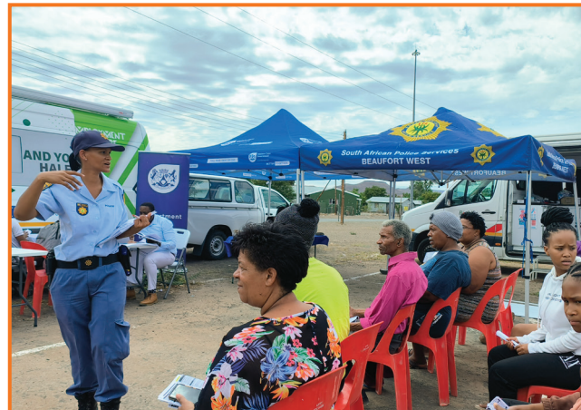
SAPS discussing community safety and stock theft during one of the outreaches.