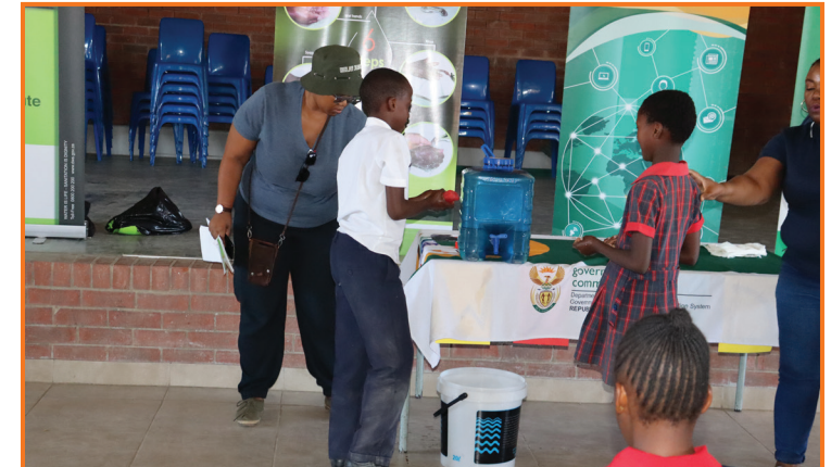
Two learners demonstrating how to properly wash hands.