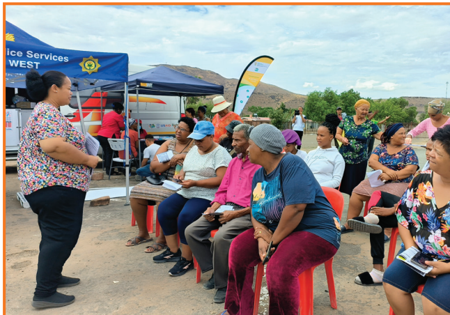
The Department of Employment and Labour engaging the community during one of the outreaches.

These outreaches improve citizens' interaction with government institutions, help increase public awareness of government policies and regulations. They are also such an important vehicle for ensuring that no one is left behind in all rural communities.