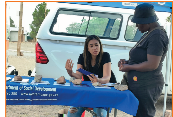
The DSD engaging with the community on foster parenting during one of the outreaches.