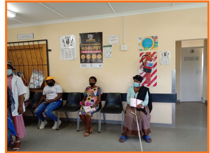
Posters were placed at a local clinic.

Government continues to ensure that all community members, including those in far-flung areas, receive information to help them alleviate social problems within society. In its mandate to provide information, the Government Communication and Information System (GCIS) office in O.R. Tambo District collaborated with the O.R. Tambo District Municipality, community development workers and ward councillors to conduct a COVID-19 and vaccination awareness campaign at Kwantsila on 10 February 2021.