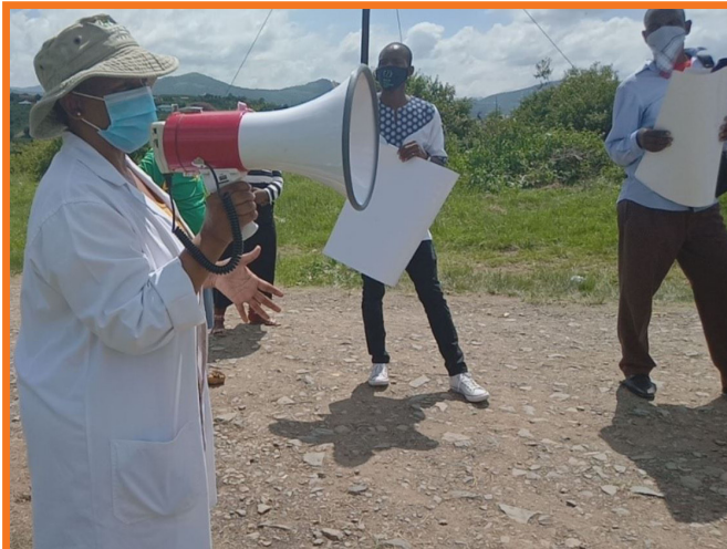
O.R. Tambo Environmental Health official conducting a COVID-19 awareness at Kwantsila village.

By Phiwokuhle Zokufa: GCIS, Eastern Cape