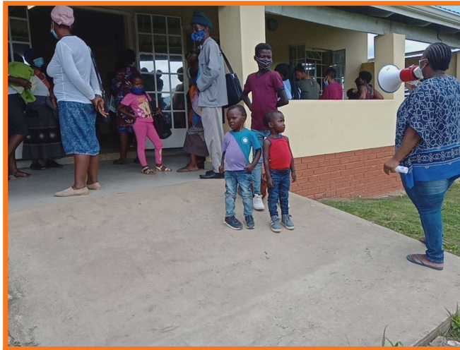
Awareness campaign on COVID-19 regulations at a clinic in Kwantsila village.